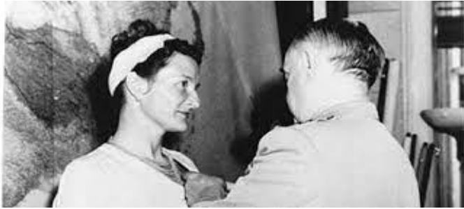
General Donovan presents Virginia Hall with Distinguished Service Cross, 1945