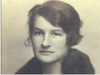
Virginia Hall Goillot, ca. 1930s

"When James Bond was still in diapers, Virginia Hall was behind enemy lines, playing a dangerous game of cat and mouse with Hitler's henchmen. Did this shero have second thoughts after a terrible accident left her needing a wooden leg? Please...Virginia Hall