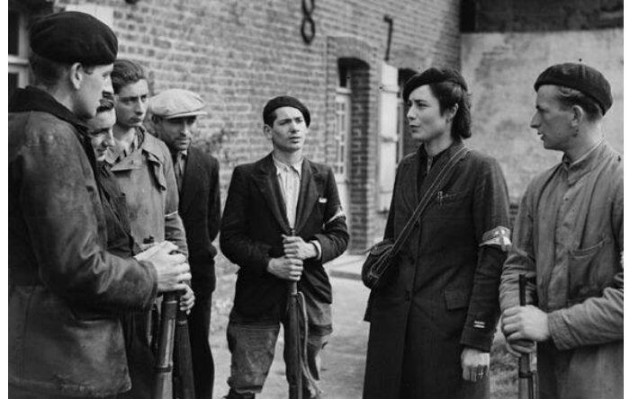
Virginia Hall meeting with French Maquis operatives

organizing resistance movements; supplying agents with money, weapons, and supplies; helping downed airmen to escape; offering safe houses and medical assistance to wounded agents and pilots."