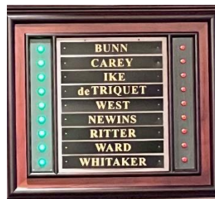
Chesapeake City Council unanimously approves lease for Fire Station #7.

• Post Moving Forward with Fire Station #7 Lease. On March 1, 2023, the Post leadership met with Chesapeake City representatives to sign the lease authorizing the use of Fire Station #7, located at 3329 South Battlefield Boulevard, for use by both the VFW Post 2894 membership and its associated Auxiliary.