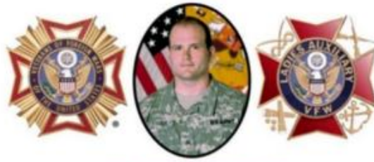
Veterans of Foreign Wars SSG Jonathan Kilian Dozier Memorial Post 2894 Chesapeake Virginia

The Veterans of Foreign Wars, SSG Jonathan Kilian Dozier Memorial Post 2894, are sponsoring their 12 th Annual Chesapeake Bataan Death March Memorial Walk on Saturday, April 8th, 2023. The walk takes place at the Dismal Swamp Canal Trail in Chesapeake, Virginia and consists of three different distances, 16.6 miles, 5 miles, and 1 mile.