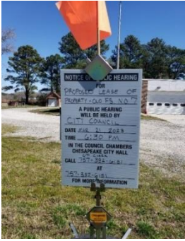
Chesapeake signage at site of future VFW Post 2894 home.

A ceremony to mark this commemorative event in the continuing saga of developing a permanent location for VFW Post 2894 is planned for late April, so stay tuned to ensure your availability for the “Grand Opening” of the VFW Post 2894 Chesapeake “Home”!