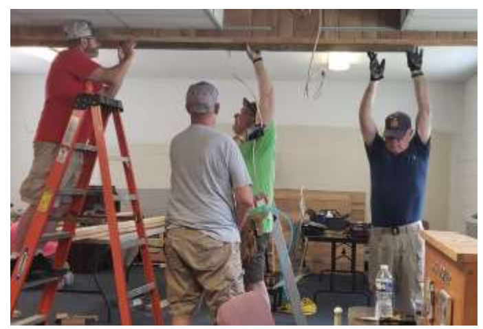
Post volunteers create the partition support frame from recycled studs from the removed wall.