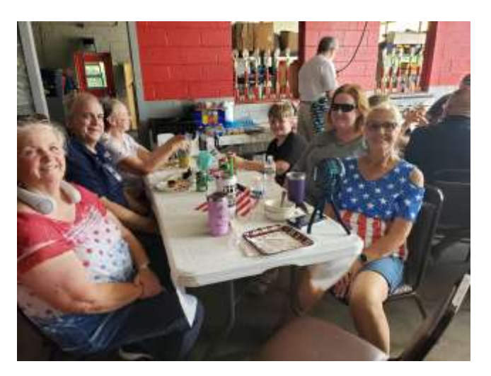
VFW Post 2894 comrades and Auxiliary members enjoy themselves at the Post barbeque after the 4th of July Parade.