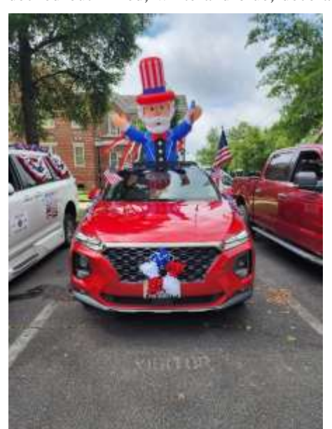
Uncle Sam prepares for his ride in the parade.

and joined the parade in South Norfolk to celebrate the 248<sup>th</sup> birthday of our nation. The cooperative weather allowed the parade to be a