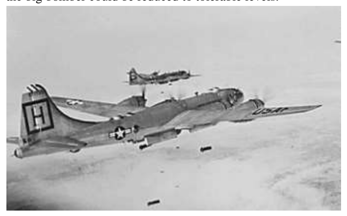
A B-29 Superfortress drops bombs on targets in the Pacific Theater of Operations during World War II.

In the summer of 1944, the 25-year-old U.S. Lieutenant Colonel Paul W. Tibbets had a problem. He was in charge of training pilots on the Army Air Forces' newest, biggest and most complicated bomber yet, and the task was turning out to be much more onerous than he'd anticipated. Tibbets' men were putting up unprecedented resistance. In point of fact, the pilots had every reason to be wary. The B-29 was not only much larger and heavier than any bomber the U.S. had flown before, it also hadn't gone through the years of operational testing to which Boeing had subjected its predecessor the B-17. Initially engine fires were one of the major problems. The planes' Wright engines were often called the Wrong engines. Part of the trouble could be traced to the engine cowlings that were too tight and often caused fires even before the planes had taken off. Although engine improvements were made over time, fires remained a problem throughout World War II.<sup>1</sup> Problems were still being encountered at the combat crew-training bases, and Tibbets felt that something needed to be done to reduce delays and losses that were occurring. His plan was to train two women to fly a B-29 and tour the training bases to demonstrate that risks of flying the big b6mber could be reduced to tolerable levels.<sup>2</sup>