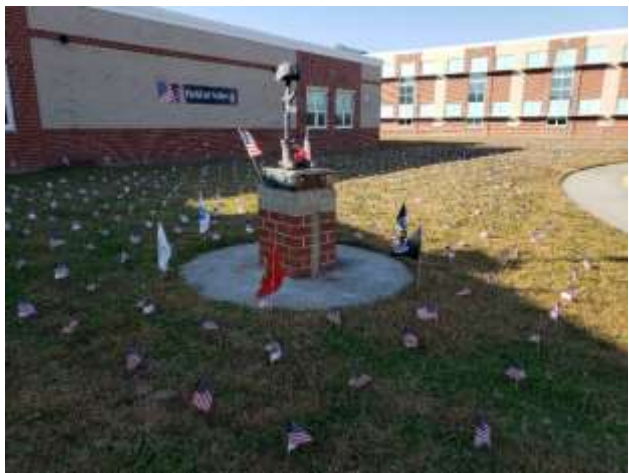
Veterans Day Field of Valor at Grassfield High School.

The tribute began early in the week at Grassfield High School's Field of Valor commemoration on Thursday, 9 Novem-