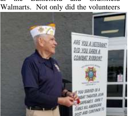
raise almost $5000, but we were able to recruit several new members for the Post. Thanks to everyone who assisted with this effort to ensure it was another tremendous success!

Again. VFW Post 2894 held its semiannual Buddy Poppy Fundraiser on the weekend of 4-5 November. Several Post members came out on the beautiful weekend to hand out poppies and solicit donations from the local area residents at the Battlefield and Grassfield