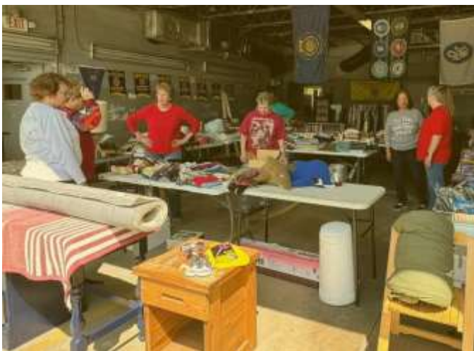
Members from VFW Post 2894 Auxiliary prepare items for the inaugural Garage Sale in April.

• Post 2894 Auxiliary Holds Inaugural Garage Sale. On Saturday, 27 April the Auxiliary held the first garage sale at the Post. This was a “test” for future similar events for the Post and Auxiliary. The Auxiliary members donated all the goods for the sale, so we had a ton of household goods, and an entire table of cars! We had much of the membership participate in the set up and breakdown which helped us learn a timeline for these events, how many tables we need, and whether to provide food or not. So many things to think about. Once the Post receives its occupancy permit from the city, we will look forward to inviting the public to participate in future yard sales.