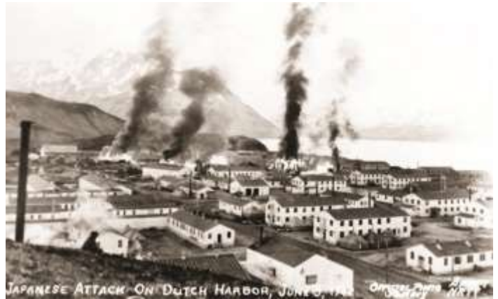
Burning buildings after a Japanese attack on Dutch Harbor, June 1942.

barrels of oil, a month's supply for Dutch Harbor, were destroyed. A naval hangar, still under construction, had a big hole punched through its roof and a Catalina PBY inside was damaged. The total death for the two-day attack was forty-three and another fifty were wounded.