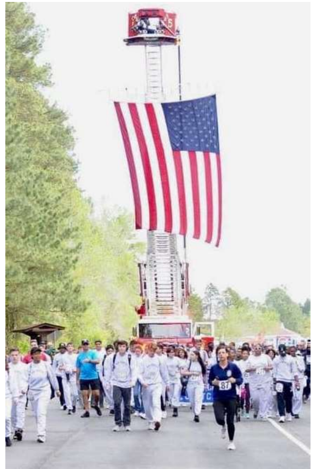
Runners start the one mile walk at the BDM Memorial Walk/Run.