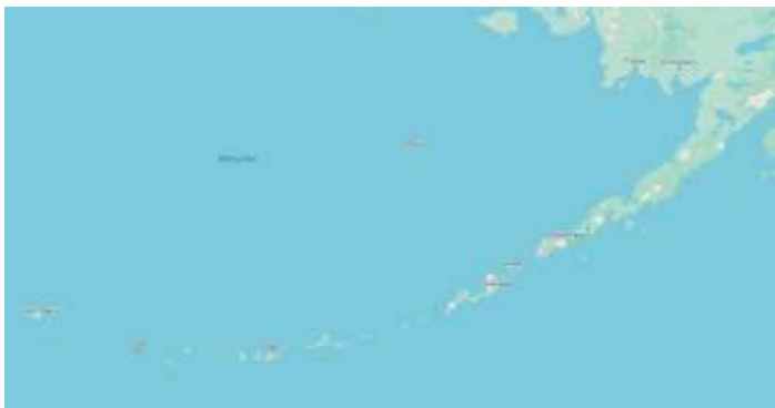
Aleutian Island chain of Alaska. Unalaska Island is in the lower-center of the map; Attu is in the lower left corner.

Known to historians as the "Forgotten War," the Aleutian Campaign began on June 3 rd , 1942, when Japanese planes bombed Dutch Harbor on Amaknak Island (part of Unalaska Island) in the Aleutian Island chain of Alaska. In June, 1942, American military strength in Alaska stood at 45,000 men, with about 13,000 at Fort Randall (Cold Bay) on the tip of the Alaska Peninsula and at two Aleutian bases: the naval facility at Dutch Harbor on Unalaska Island, 200 miles west of Cold Bay, and a recently built Army air base (Fort Glenn) 70 miles west of the naval station on Umnak Island. Army strength, less air force personnel, at those three bases totaled no more than 2,300, composed mainly of infantry, field and antiaircraft artillery troops, and a large engineer construction contingent, which had been rushed to the construction of bases.