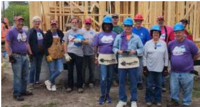
Participants in the Heroes Build pose for a picture.