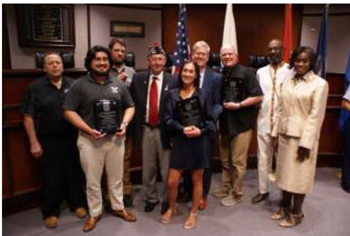
VFW Post 2894 recognized Top Supporters of the past year's community service projects.

On Monday, 13 May, the Post held its annual Awards Ceremony where numerous individuals and organizations were recognized. A separate newsletter with the details was published recently – if you did not receive it, let the newsletter editor know and he will forward you an electronic copy of that special edition.