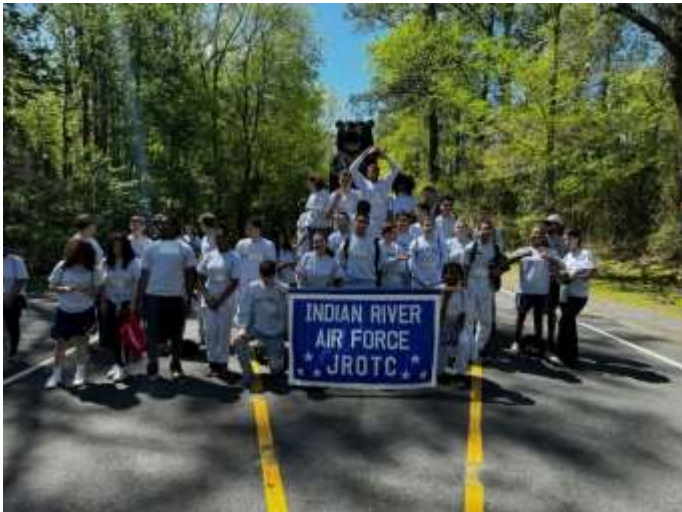
Cadets from the Indian River Air Force Junior ROTC showed up in force to participate in the BDM walk.