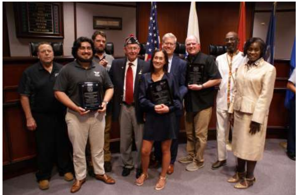
VFW Post 2894 recognizes Top Supporters of the past year's community service projects.

VFW Post 2894 held its annual Awards Ceremony on Monday, 13 May 2024, in the Chesapeake City Council Chambers. Due to the number of awardees and associated pictures, it was decided that a special edition of the Post Newsletter would be developed just to honor all those individuals and organizations receiving awards that evening.