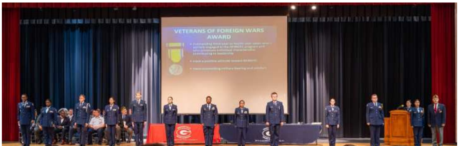
Twelve Air Force Junior ROTC cadets receive VFW medals/certificates at the Grassfield High School Awards Ceremony, 7 May 2024.