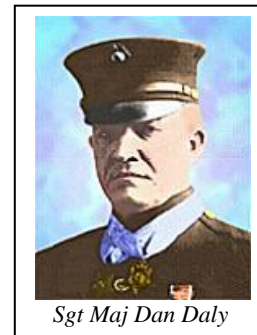
Sgt Maj Dan Daly