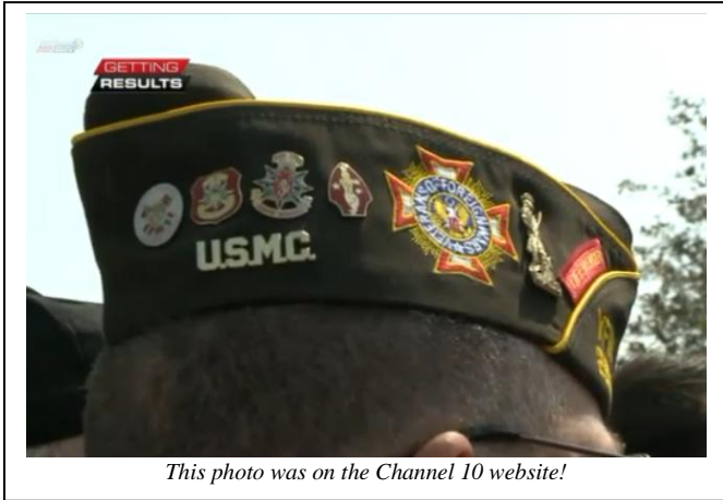
This photo was on the Channel 10 website!

A Virginia Department of Veterans Services benefits field office is now open on the Chesapeake campus of Tidewater Community College.