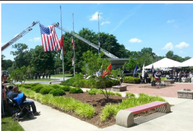
It was a beautiful day on 25 May 2015 in front of City Hall