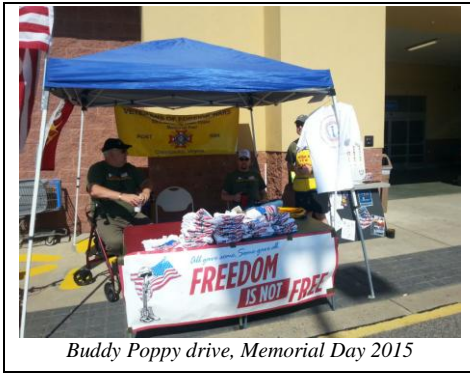
Buddy Poppy drive, Memorial Day 2015