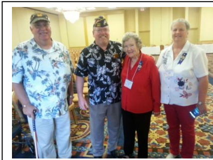
2894 representatives at the 2015 Department Convention

They attended most of the activities of the convention including the elections of the new Department Commander,