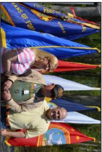
VFW Post 2894 is a 501(c)(19) non-profit, charitable veterans' organization with IRS Identification Number 54-0449022