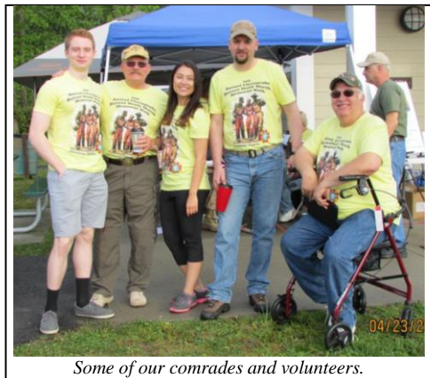
Some of our comrades and volunteers.