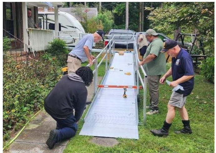
VFW Post 2894 volunteers finish up the final details of the aluminum wheelchair ramp for a Vietnam War Veteran and his family.

the group took on a larger project that required an L-shaped ramp extending from the end of the porch out into the yard for about twelve feet and then running the length of the yard to the driveway for about sixteen feet. After removing the somewhat unstable