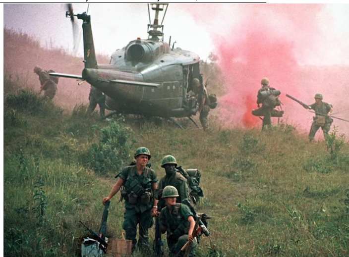
American forces evacuate from a landing zone during the Battle of the Ia Drang Valley.

On the second day, North Vietnamese forces launched a heavy attack including hand-to-hand combat. Charlie Company took the brunt of the assault. A "Broken Arrow" was declared over the radio by the Battalion Forward Air Controller, which meant that an American unit was in imminent danger of being overrun. It was the signal for all available American aircraft to converge and provide aid to the American unit.