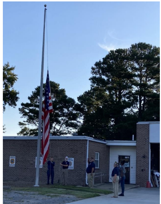
VFW Post 2894 comrades raise the holiday flag and lower it to half mast in commemoration of Patriots Day, 11 September.