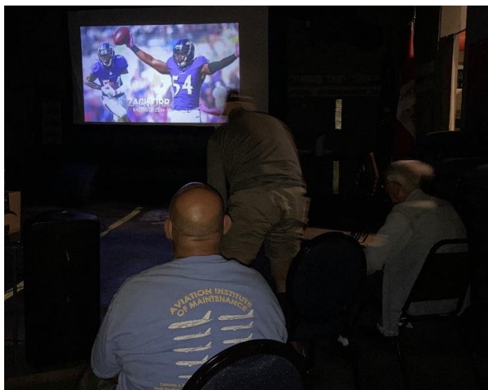
VFW Post 2894 comrades watch the Ravens/Chiefs NFL football game on the big screen in Post HQ Bay One.