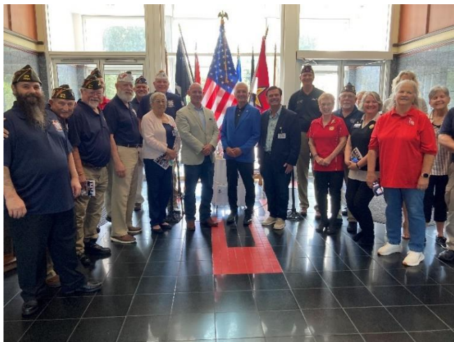
Attendees at the POW/MIA Commemoration pose for a picture with the Chesapeake City mayor and city council members.