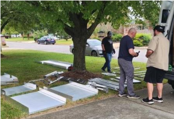
VFW comrades lay out sections of the aluminum wheelchair ramp in the initial stages of construction.