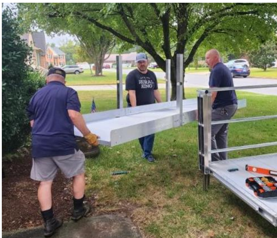
Volunteers from VFW Posts 2582 and 2894 place aluminum ramp sections during the construction of a wheelchair ramp for a Vietnam veteran and his wife in Suffolk, Virginia.