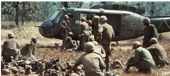
UH-1 "Huey" helicopters provide support to the 1st Cavalry Air Mobile Division during the Battle of the Ia Drang Valley, November 1965.

The Battle of the Ia Drang Valley would come to be remembered as one of the most iconic battles of the Vietnam War, and later would set the scene for the film We Were Soldiers based on the novel We Were Soldiers Once.....And Young . It was the first major combat action between U.S. ground forces and the North Vietnamese Army. And it all began early one fall day.