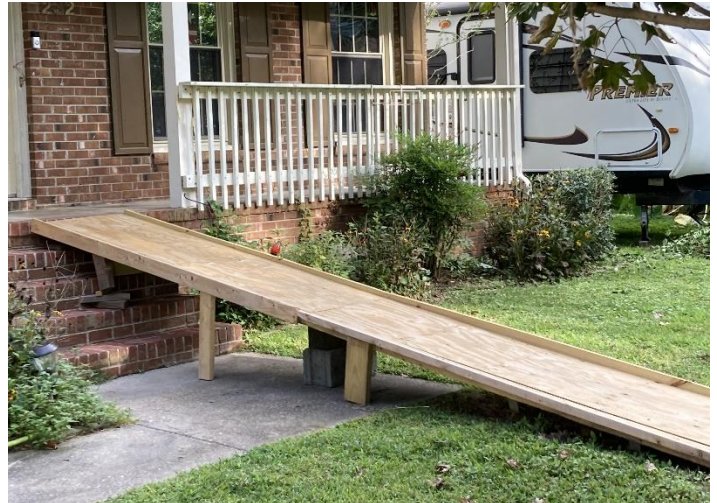
Original wheelchair ramp used by the Chesapeake veteran's family prior to the upgraded ramp project.