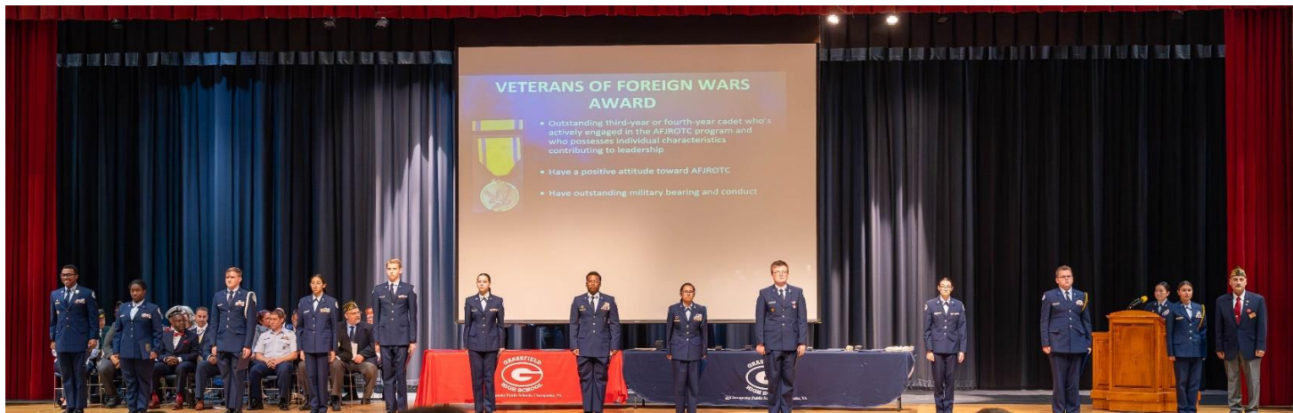
Twelve Air Force Junior ROTC cadets receive VFW medals/certificates at the Grassfield High School Awards Ceremony, 13 May 2025.