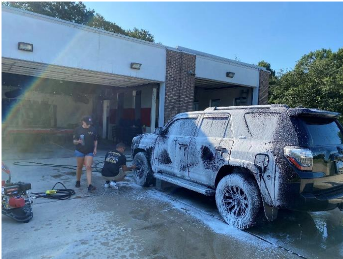
Members from the Chief Petty Officers Mess from the USS Arlington turn to during their car wash fundraising event.