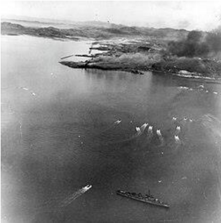
Landing craft of the first and second waves approach Red Beach on 15 September 1950.

Nations Command (UN). The operation involved some 75,000 troops and 261 naval vessels and led to the recapture of the South Korean capital of Seoul two weeks later. The code name for the Inchon operation was Operation Chromite.