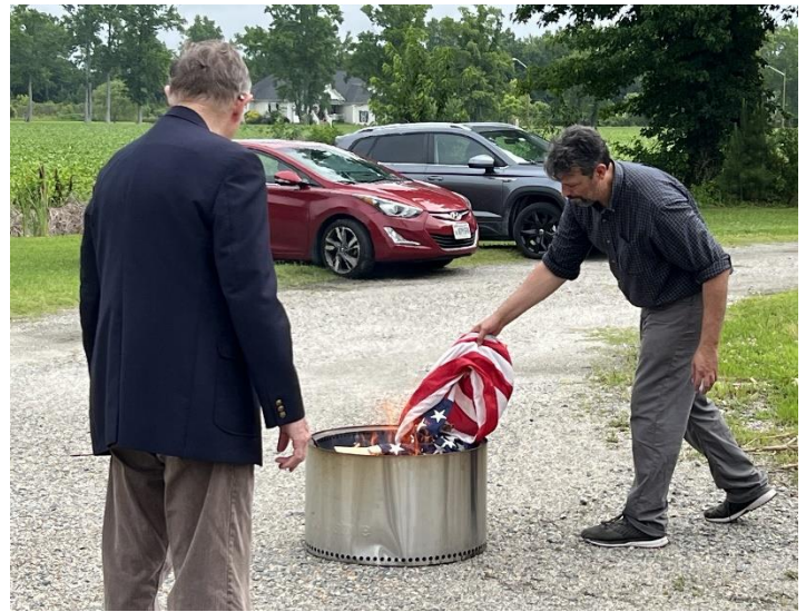
A member of the Virginia Society of the Sons of the American Revolution, Great Bridge Chapter, places an American flag in the burn barrel during the 14 June flag retirement ceremony.