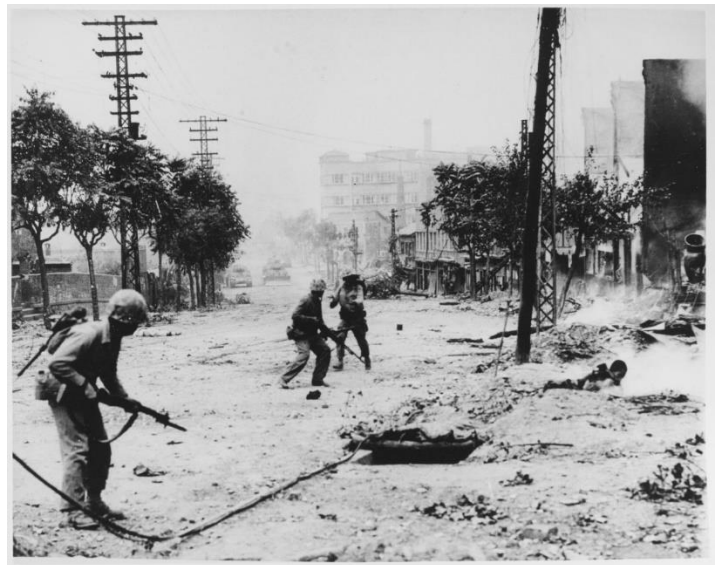
US Marines engaged in urban warfare during the battle for Seoul in late September 1950.