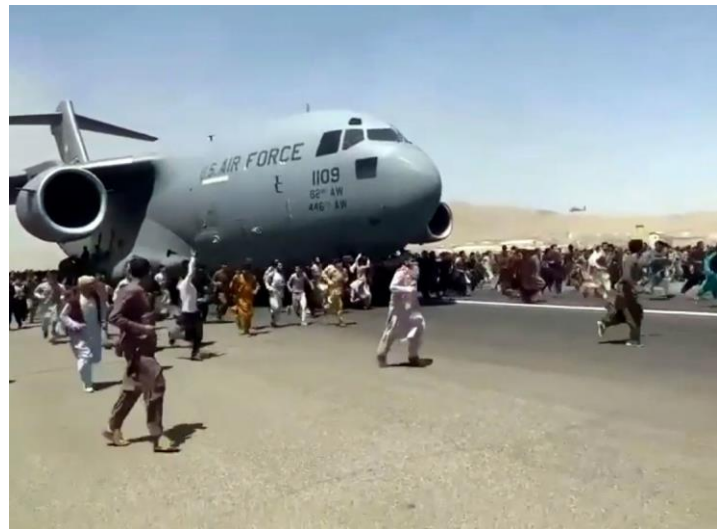
August 2021 scene at Kabul's international airport in Afghanistan.

Although the Taliban had thwarted a number of attacks on the airport facilities, an ISKP suicide bomber slipped through on August 26 and killed at least 170 Afghan civilians and 13 U.S. military personnel. The incident, in which the Taliban failed to provide the security guarantees conditioned in the peace treaty, raised concerns that the Taliban was not capable of preventing al-Qaeda, ISIL, and their affiliates from using Afghanistan to launch attacks. Plans to withdraw by the deadline went ahead, however, with U.S. forces taking additional precautions. Wariness of further attacks led U.S. forces to carry out a drone strike on August 29 that killed 10 civilians, including seven children. The target was later found not to be a security threat.