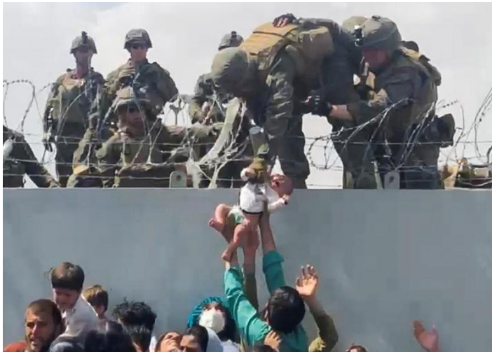
A baby is handed up to the U.S. Army over a perimeter wall at the airport in Kabul, Afghanistan, on August 19, 2021, as Afghan civilians and others evacuate

The Taliban, emboldened by the ongoing U.S. withdrawal and the end of confrontations with U.S. forces, rapidly took control of dozens of districts in May-June and closed in on several provincial capitals. The group appeared to lack both the manpower and firepower to hold its gains against the larger and better-equipped armed forces of the Afghan government, but the latter's lack of coordination and lack of responsiveness to the insurgency allowed the Taliban to overrun the country within months, even as the United States set a new deadline for August 31. By mid-August the central government had collapsed, and the Taliban had captured nearly all of the country, including the capital, Kabul.