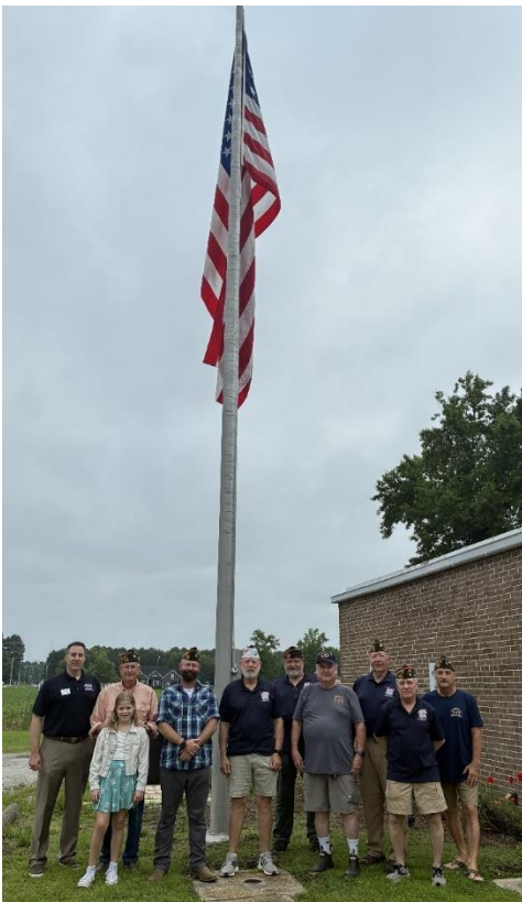
Post members participated in the raising of the Holiday Ensign on 14 June in honor of Flag Day.

Promptly at 0800, the smaller, regular flag was lowered and replaced with the much larger national ensign. Thanks to those members who came out and assisted with this event, as the larger flag definitely requires several people to ensure all the colors are handled with the proper respect and care.