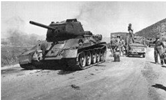
A North Korean T-34 tank knocked out by US Marines during the UN advance from Inchon to Seoul.

The battle began on 15 September 1950 and ended on 19 September. Through a surprise amphibious assault far from the Pusan Perimeter that UN and Republic of Korea Army (ROK) forces were desperately defending, the largely undefended city of Inchon was secured after being bombed by UN forces. The battle ended a string of victories by the North Korean Korean People's Army (KPA). The subsequent UN recapture of Seoul partially severed the KPA's supply lines in South Korea.