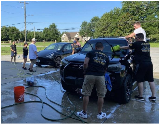
Chief Petty Officers from the USS Arlington quickly provide a wash and dry during the CPO Mess car wash at the VFW Post 2894 Headquarters.