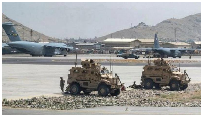
US Army soldiers assigned to the 82nd Airborne Division patrol Hamid Karzai International Airport in Kabul, Afghanistan.

During the administration of U.S. President Donald Trump (2017–21), the United States took an increasingly dismissive stance on foreign affairs. It withdrew from several international treaties and disengaged from involvement in international institutions and enterprises. On December 17, 2018, the United States met with Taliban representatives to discuss the prospect of a peace process. Days later the United States announced its intention to withdraw thousands of its troops from Afghanistan, a move generally interpreted as signaling its seriousness in reaching a peace deal with the Taliban. The announcement caught the Afghan government off guard, but officials reassured the public that Afghan forces were already handling most security operations anyway.