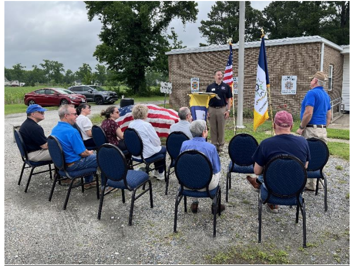
Members of the Virginia Society of the Sons of the American Revolution, Great Bridge Chapter, gather at VFW Post 2894 Headquarters on 14 June to perform a flag retirement ceremony.

Following the event, the Virginia Society of the Sons of the American Revolution (VSSAR), Great Bridge Chapter, conducted a flag retirement ceremony, disposing of several worn colors in a respectful event that was attended by both members of the VSSAR organization and Post comrades who remained after the holiday flag posting to observe the retirement ceremony.