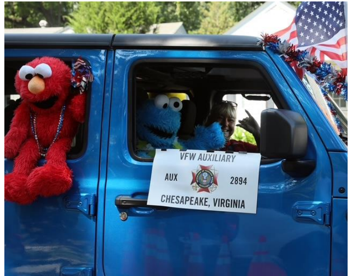
VFW Post 2894 Auxiliary member Julie Boyer rides in the South Norfolk Independence Day Parade with some furry friends.