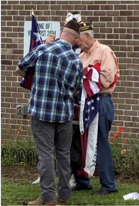
VFW Post 2894 members prepare to raise the Holiday Ensign to commemorate Flag Day.