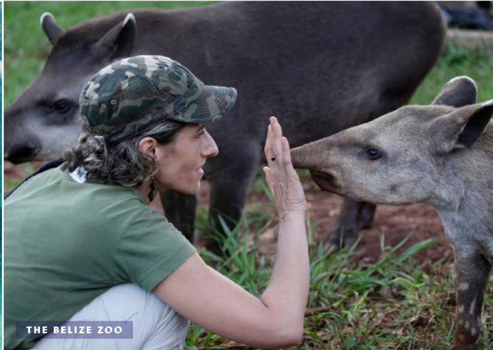
THE BELIZE ZOO