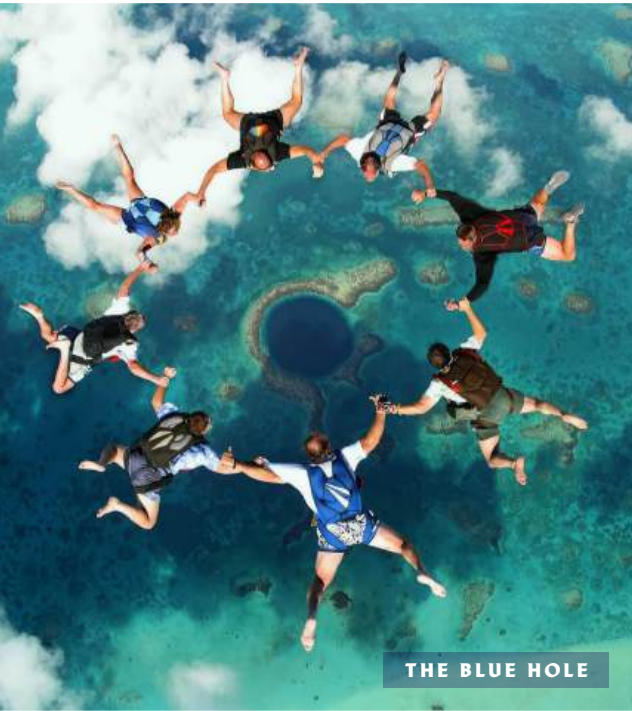
THE BLUE HOLE