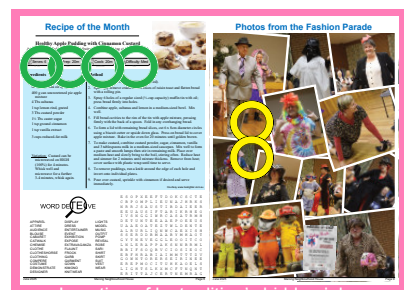
Location of last edition's hidden joke

Marong Neighbourhood House celebrates, values and includes people of all backgrounds, genders, sexualities, cultures, bodies and abilities.