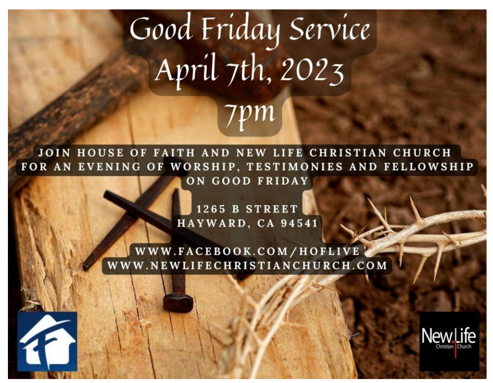
NLCC & HOF Combined Service Friday, April 7<sup>th</sup> at 7:00 pm