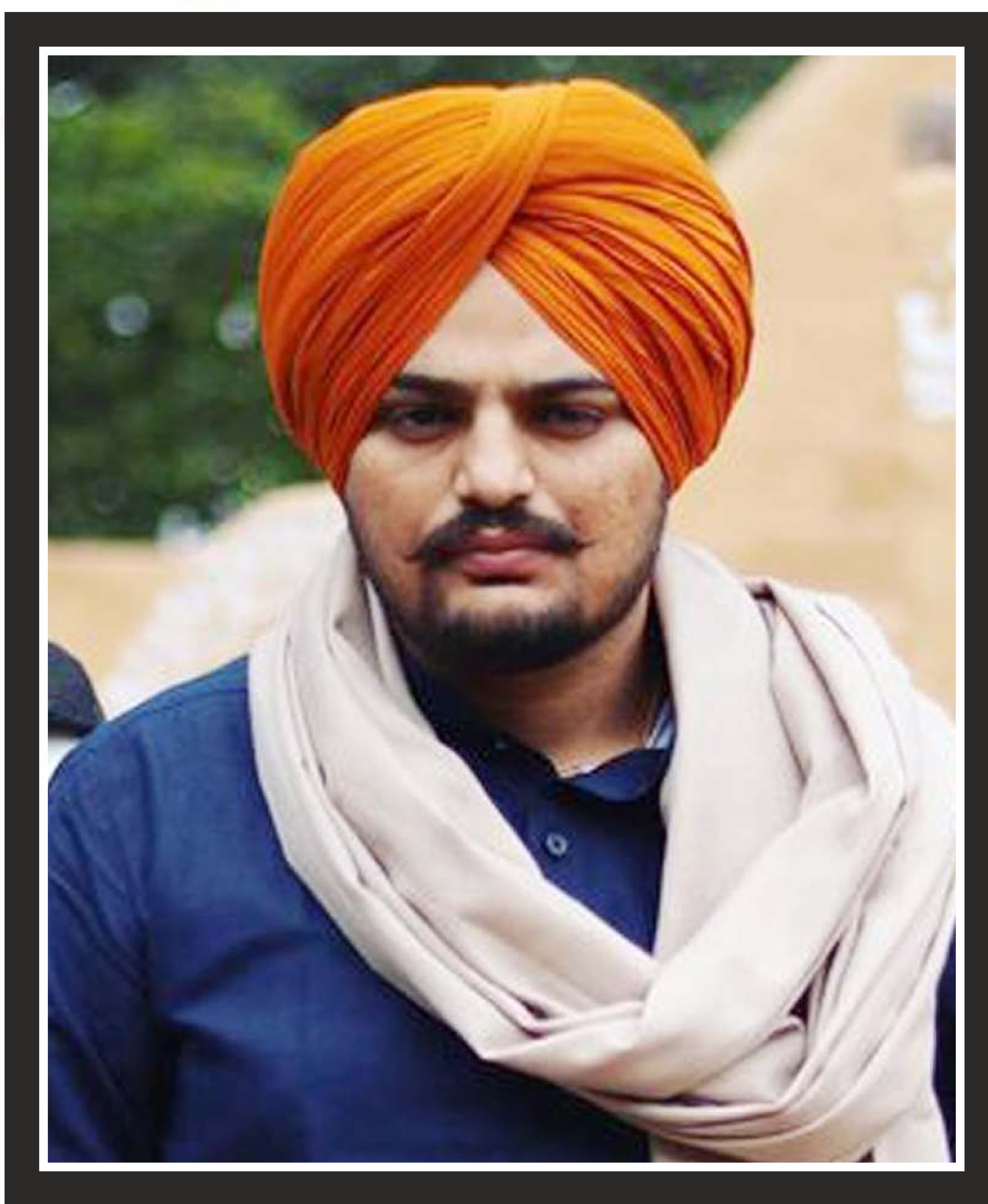
SUBHDEEP SINGH SIDHU MOOSEWALA