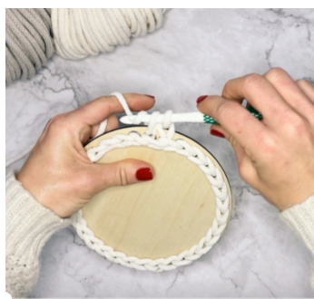
Make single crochets