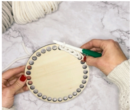
Make slip stitches