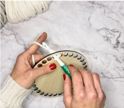
Start in any hole