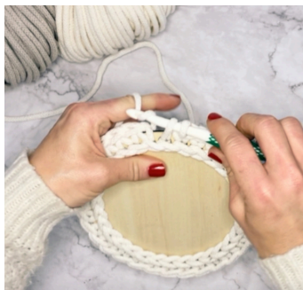
Yarn over with tail