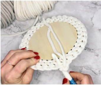
Work in back loops

Insert your hook in the back loops of the last stitch on round 2 (tail will be sticking out of the correct place)