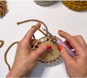
Pull up a loop, Ch 1