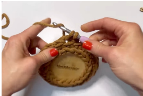
Single crochet in back loops