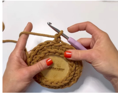
Pull up a loop, Ch 1