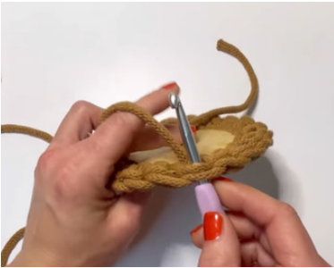
Start around 3 here

Optional-Hide the tail as you stitch or weave it in at the end.