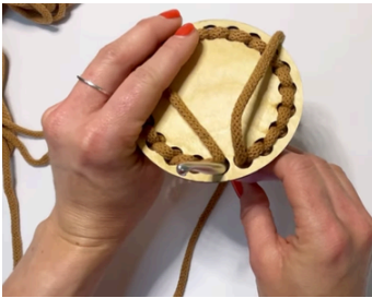
Begin Round 2

Insert your hook in the last stitch on Round 1 (the tail will be stitching out of the correct place)