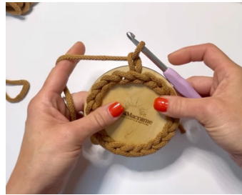
Pull up a loop, Ch 1