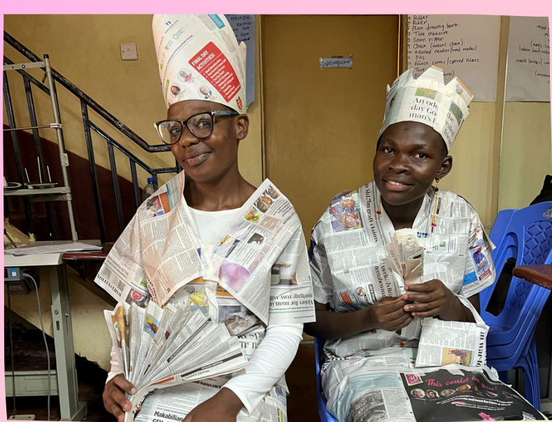
Creativity Day at Faraja