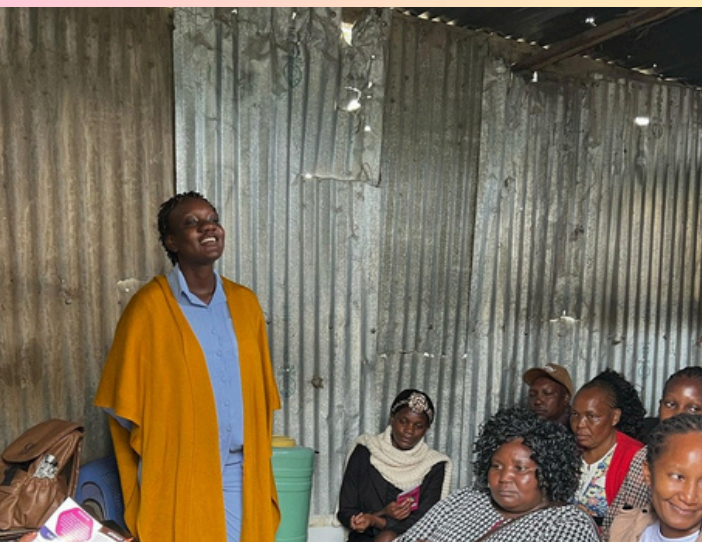
Chief baraza in Mlolongo