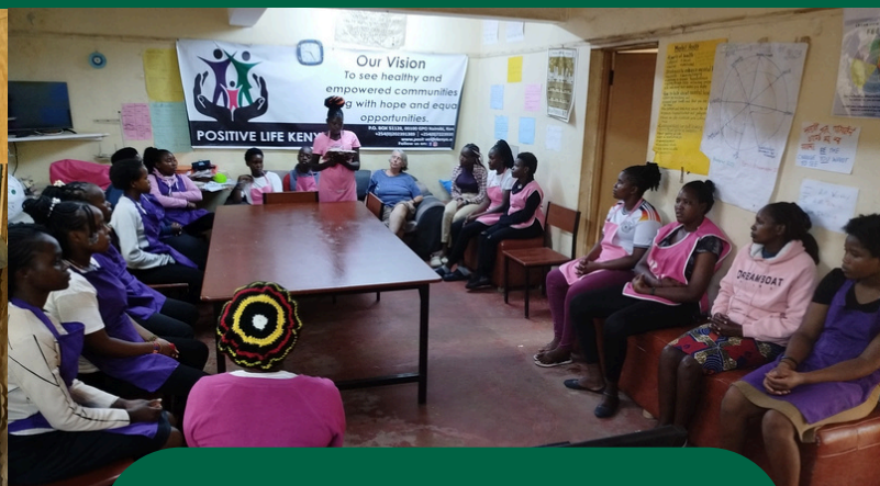
Microfinance & Table Banking