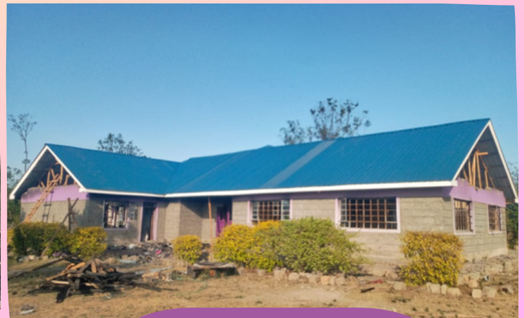
Almost completed dormitory