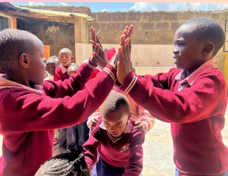
Break at Tumaini