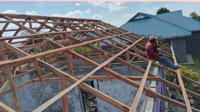
dormitory roof reconstruction

A heartfelt thank you to everyone who supported the reconstruction of the dormitory and reopening of the facility.