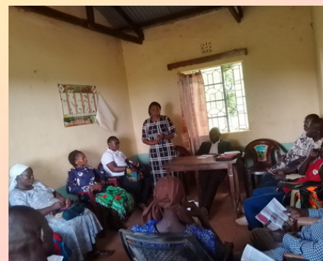
Meeting with community gate keepers