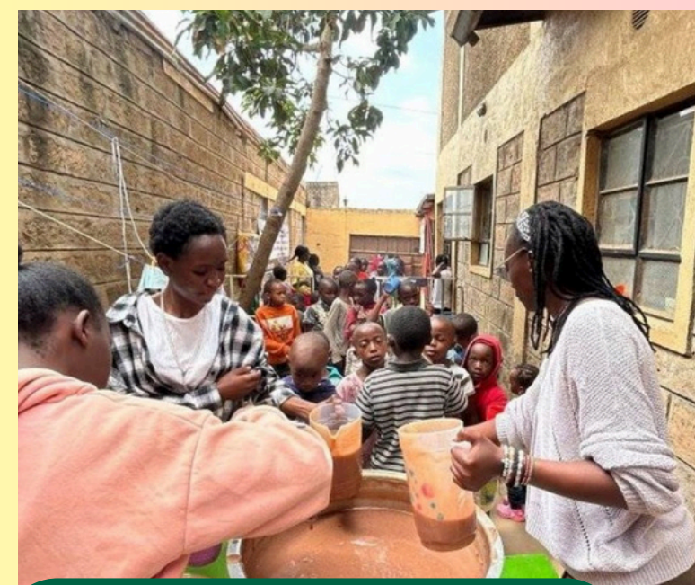
life skills program and porridge program