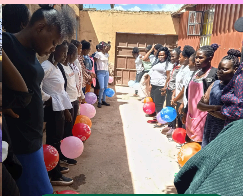
Mental wellness class