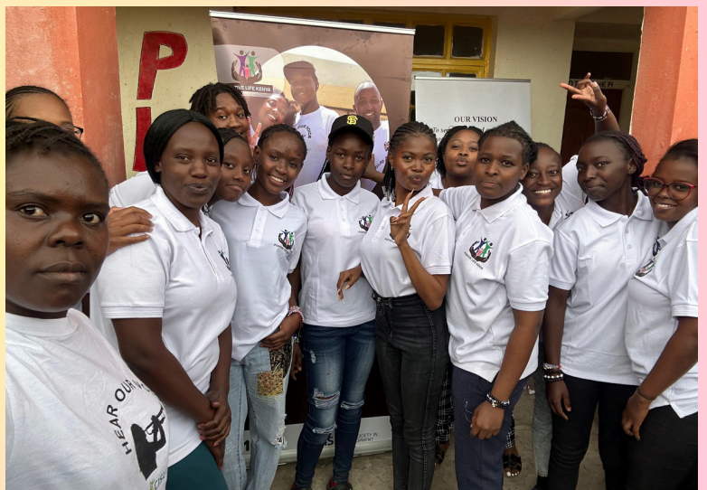
Youth ambassadors championing SRHR