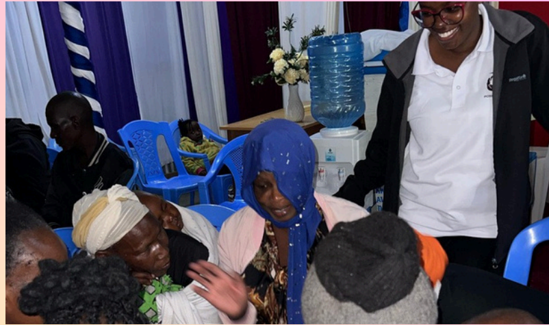
Community forum in Kicheko