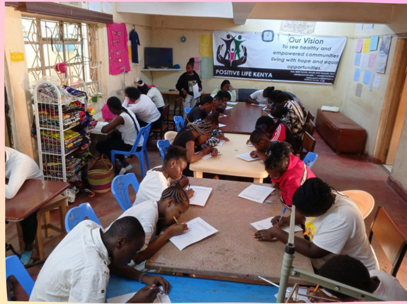
Exam period at Faraja