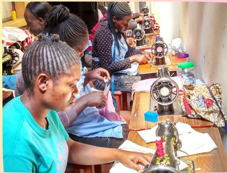
Ongoing tailoring class