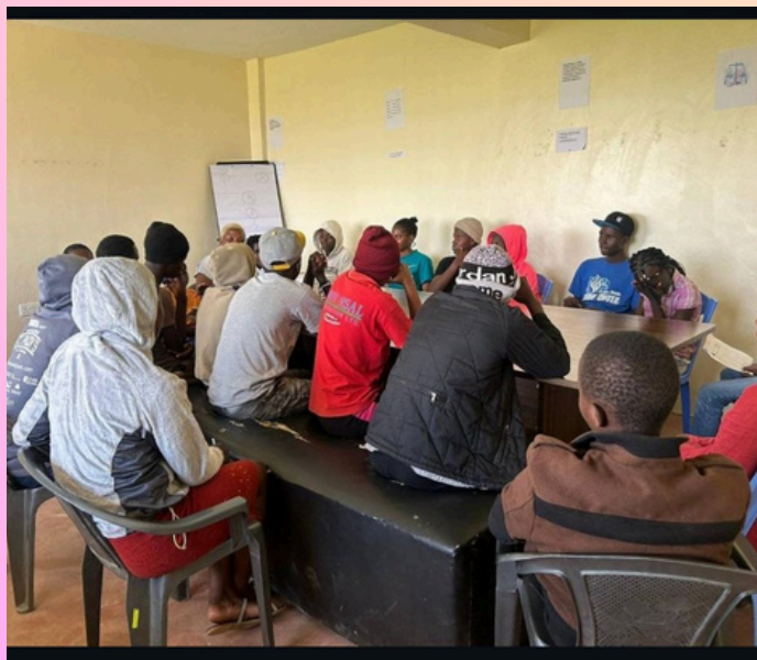
SRHR weekend training