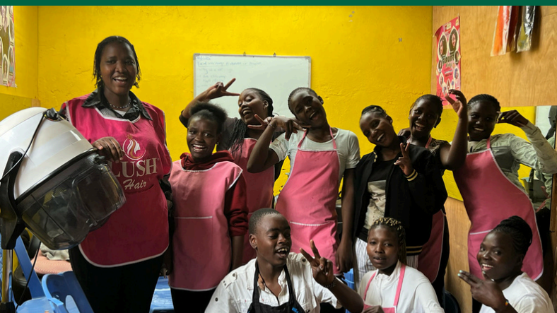
Beauty & Cosmetology