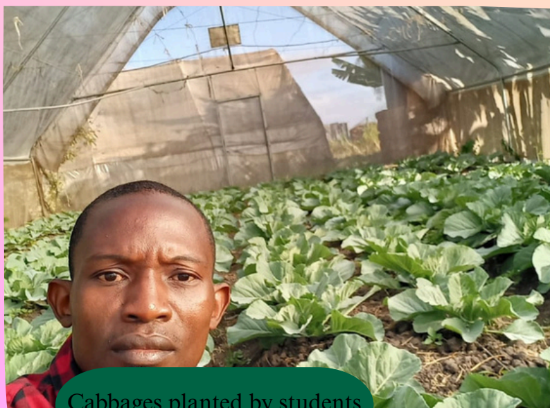
Cabbages planted by students

Your contribution will make a lasting impact on the future of these young leaders.