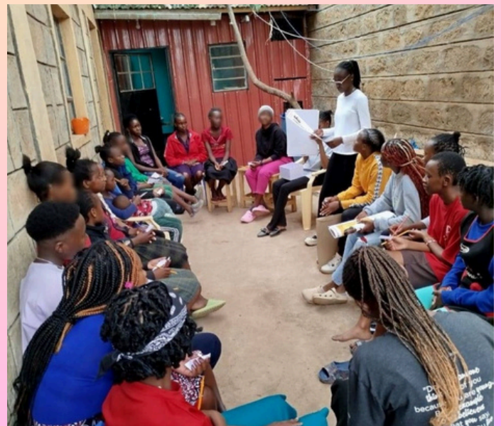
SRHR peer to peer training