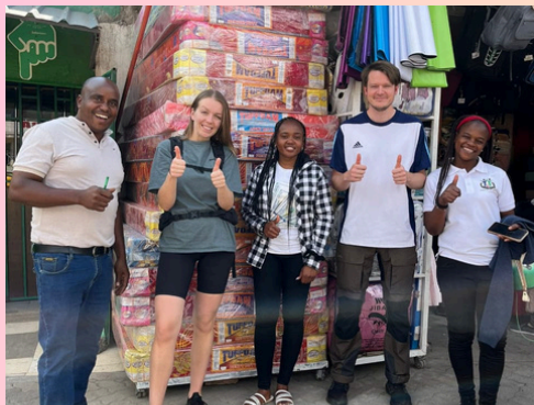
SAS YOU ASSIST