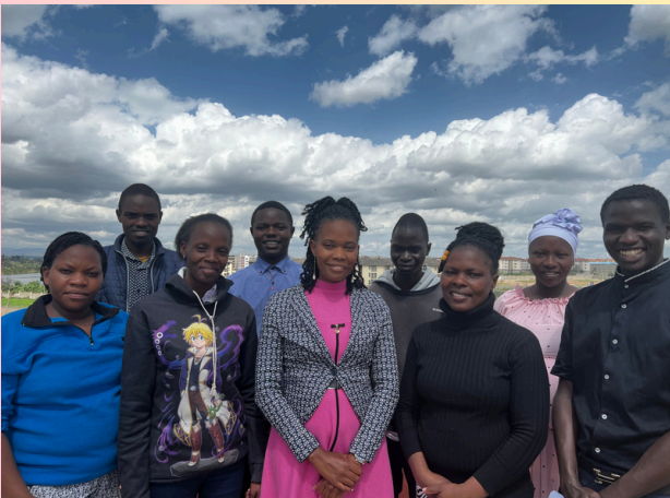
Tumaini School Teachers

These activities are already helping our children come out of their shells and shine in new ways.