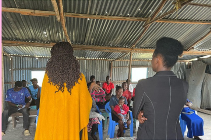
Community forum in City Carton