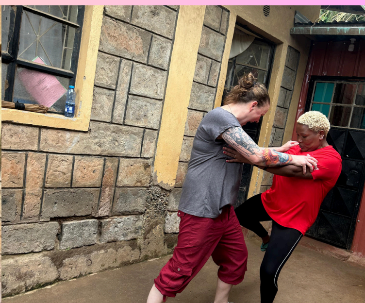
Self defence classes