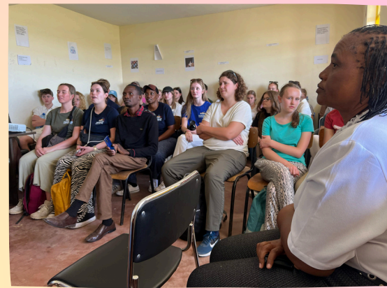
Cross Your Borders visit