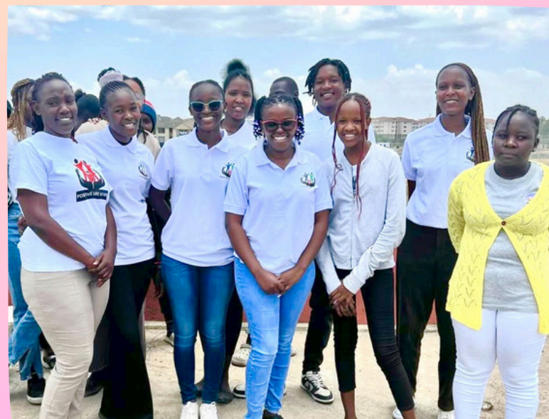
Youth Ambassadors meeting