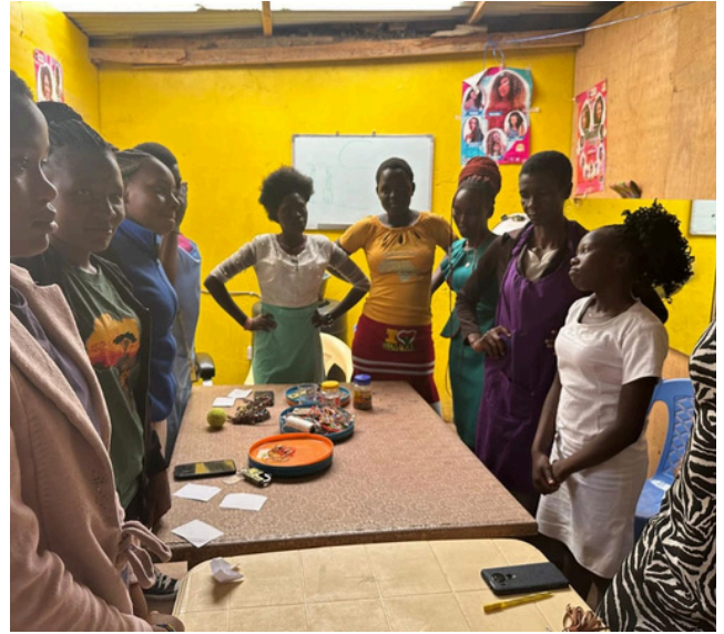
Life-skill class, discussing life goals and confidence-boosting tips.