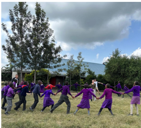
Kiotani School learning in progress

Our students are in school and learning is in progress for the second term of the school curriculum as per the Ministry of Education. The second term period is almost coming to an end, the students are doing their end term exams.