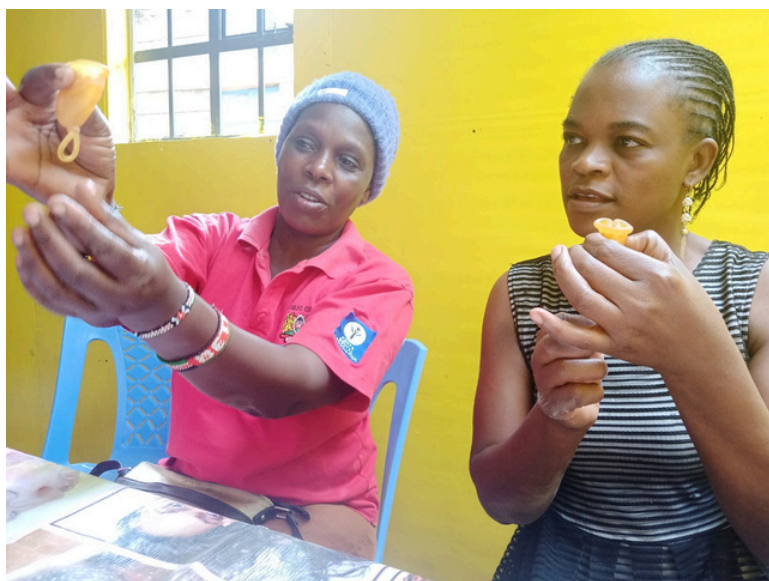
A community health worker demonstrating how to use menstrual cup