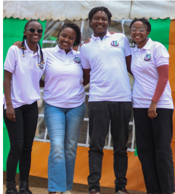
Youth Ambassadors during the Chief Barazza.