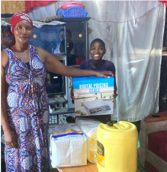
A woman, receiving support for a small business set-up.

Our social workers pay visits to the vulnerable families in Mlolongo, Athi River area, and other forgotten slums within Machakos, and Kajiado County. This is one of PLK's initiatives in the women's empowerment program, they help vulnerable families by providing food items such as eggs and milk. The families within these areas appreciate the work we do as Positive Life Kenya, we are building a healthy environment balancing addressing the needs including psychosocial support, food, and safety, and breaking barriers along the way.