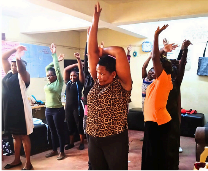
Yoga class in session.