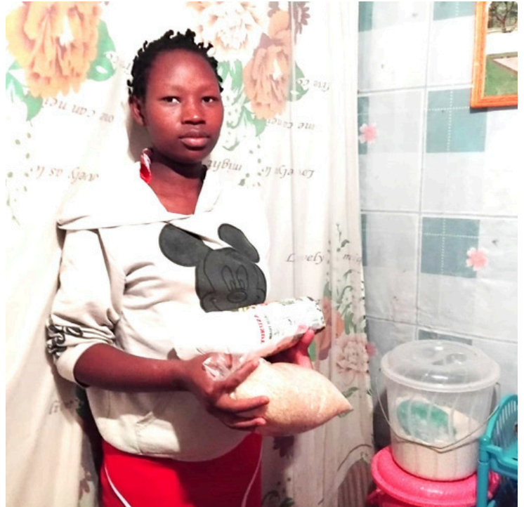
Food portion donations during a home visit.