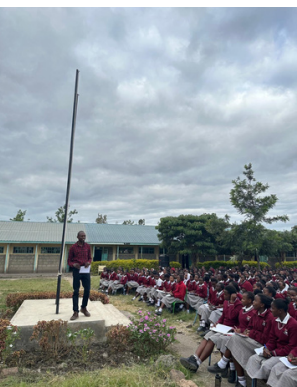
Kanani Girls High School

Breaking the silence is one of core projects under civic education, the first phase of this project ended last year and the second phase picked up towards the end of last year. Youth ambassadors participated in a Chief Barazza, held at the Chief office in Mlolongo, Machakos County. These young people shared their grievances, the gap in leadership and addressed the issues facing the community, they addressed crucial health issues in SRHR. We are making progress both in schools and in the community, here are a few highlighted stories.