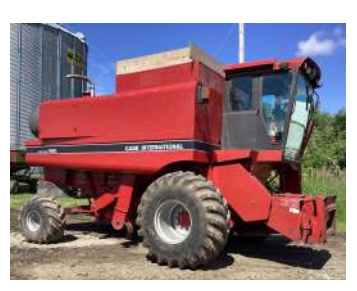
Case IH 1660 Axial Flow Combine