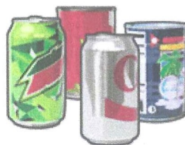
Aluminum Cans (Empty and Clean)