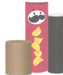
Paperboard Cans (Like Pringles or Biscuit cans)

*Please leave your plastic tops on your plastic bottles. Glass should remain the same with no tops.