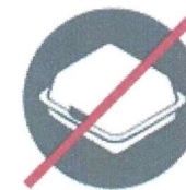
Carryout Food Containers