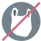
Plastic Bags and Film