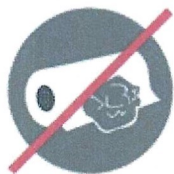
Paper Towels and Napkins