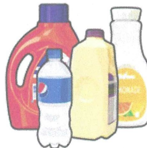
Plastic Bottles, Jars and Jugs (Empty and Clean)