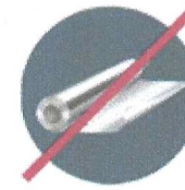
Foil/ Foil Pans

BALTIMORE CITY DEPARTMENT OF PUBLIC WORKS Bureau of Waste Diversion (410) 396-4511 publicworks.baltimorecity.gov/recycling-services