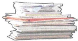
Paper (All Colors and Types)