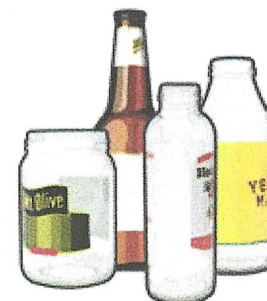
Glass Bottles and Jars (Empty and Clean)