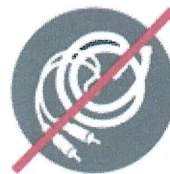
Tanglers: Garden Hoses, Wires, etc.