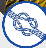
Ropes & Wire Cables