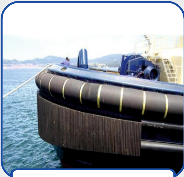
Hallow Fender For Tug Boats

We offer supply & repairs of Marine Fenders such as Key Hole Type, D Shaped, cylindrical, square shaped, rectangular Hallow Fender for Tug Boats, Arch, Cell & Air Fenders. These Fenders are manufactured as per the preferences of our clients. Clients can avail them in different sizes and dimensions and we are able to cater diverse requirements of the clients across the industry. These fenders are functionally advanced in nature and are corrosion resistant.