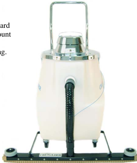
#4017 30" Front Mount Squeegee shown on 15 gallon vacuum

The M850-15-4017 comes standard with a 50' cord and 30" front mount squeegee, but does not include a 10' hose, filter bag, and paper bag.