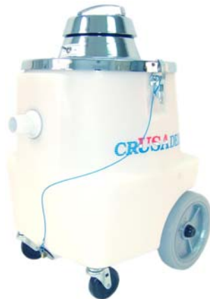
10 Gallon Utility Series vacuum shown above