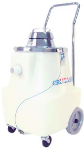
15 Gallon Utility Series vacuum shown above

The Crusader Utility Series Vacuums are highly maneuverable and are designed to handle the toughest jobs in almost any environment. These vacuums are built for years of trouble free service at an affordable price to meet your budget. This vacuum comes equipped with a wet/dry universal filter bag but for finer dry particles we recommend the following proper filters (4049 coated bag, 4031 filter protector, 4013 disposable paper bag).