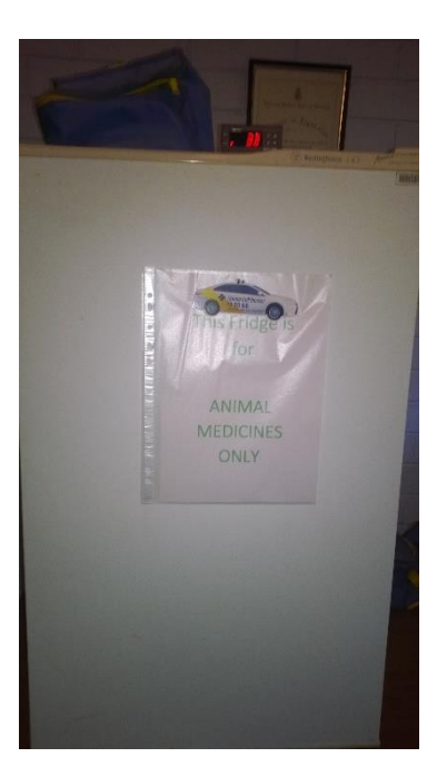
Where are your vet medicines stored?

Hopefully not in a tin shed in this hot weather. Read the label instructions carefully and follow them exactly e.g. O drench needs to be stored below 30C and not refrigerated. I have my Q drench stored in a special cool area under the house with a temperature probe that sounds an alarm if it reaches 30C. Most of my veterinary medicines are in a special refrigerator with a digital display temperature monitor.