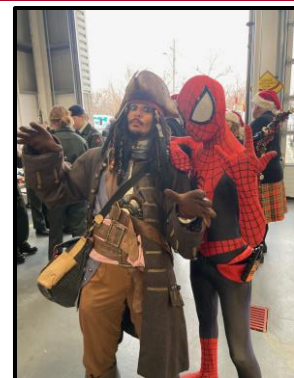
Two additional characters anxious to set off!