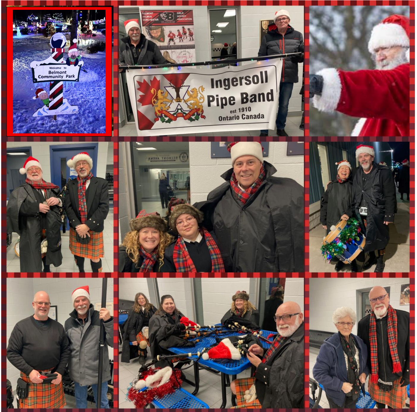
All the usual suspects pictured above!

Once again, the band can never be quite sure what kind of conditions that we will be marching in! Pretty much a given that it will be cold (and yes it was) but thankfully we avoided rain/sleet/and snow falling this year. It was however, extremely windy, so driving to Belmont was a bit of an adventure with snow squalls keeping us company on route! Thankfully, we had a large contingent of members and supporters that made sure we had a nice big band for our stroll down Belmont Road – the main street.