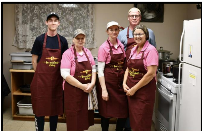
Our terrific catering crew

It's always a great evening for everyone to unwind and connect not only with band members on a social level but also their family members. It's also a time to thank everyone connected to the band for all their support over the past year, in particular our 115 th Anniversary Year, as there was so much going on!