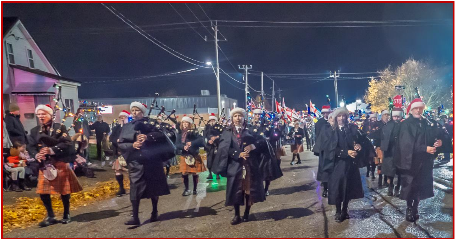
A great photo of the IPB. We were just heading out on parade!