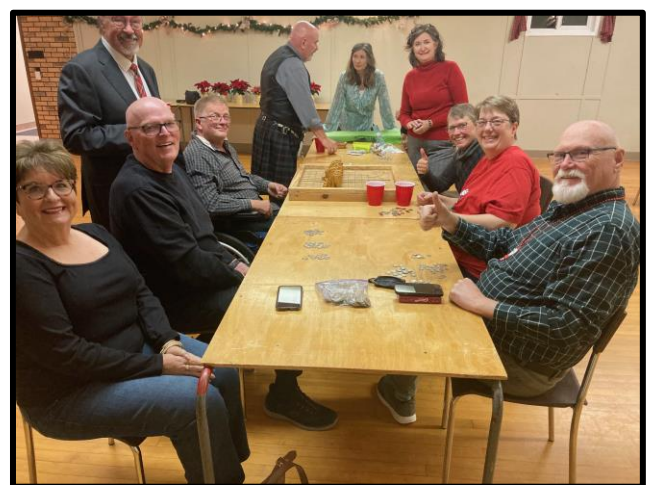
Participants in the Horse Race Game and additional Card Games

Thanks to all the committee members who organized the evening and made sure that everyone had a good time!