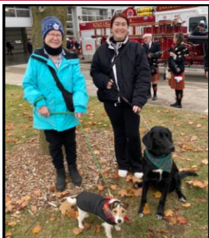
Two canine mascots waiting patiently with their caregivers to march in the parade!