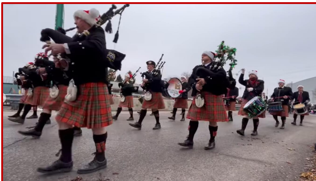
More video footage! Click on the photo above for "Good King Wenceslas"!