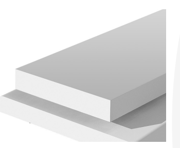
Jamb Extension Sizes: PVC WH4 (W) 5/8" x 4-9/16" PVC CL4 (S) 5/8" x 4-9/16" PVC WH6 (W) 5/8" x 6-9/16" PVC CL6 (S) 5/8" x 6-9/16"

Our cellular PVC casings and jamb extensions are an excellent alternative to wood because they: