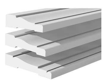
Colonial Casing Sizes: PVC WM 356 (W/S) 11/16" x 2-1/4" PVC WM 351 (W/S) 11/16" x 2-1/2" PVC WM 445 (W/S) 11/16" x 3-1/4"