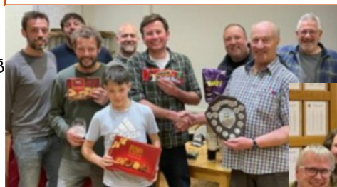
Above: Winners = Upper

Thank you to all those who subscribed to the 100 club for 2023-2024. The Village Hall is grateful for your support.