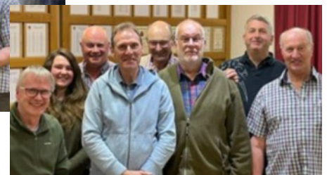
Below: Runners Up = Park