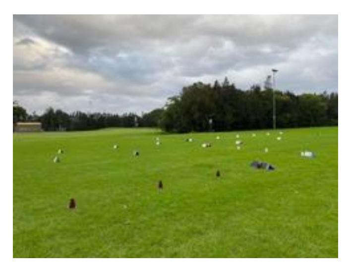
We are planning a Classic Obedience Information Night in the near future we hope you can join us