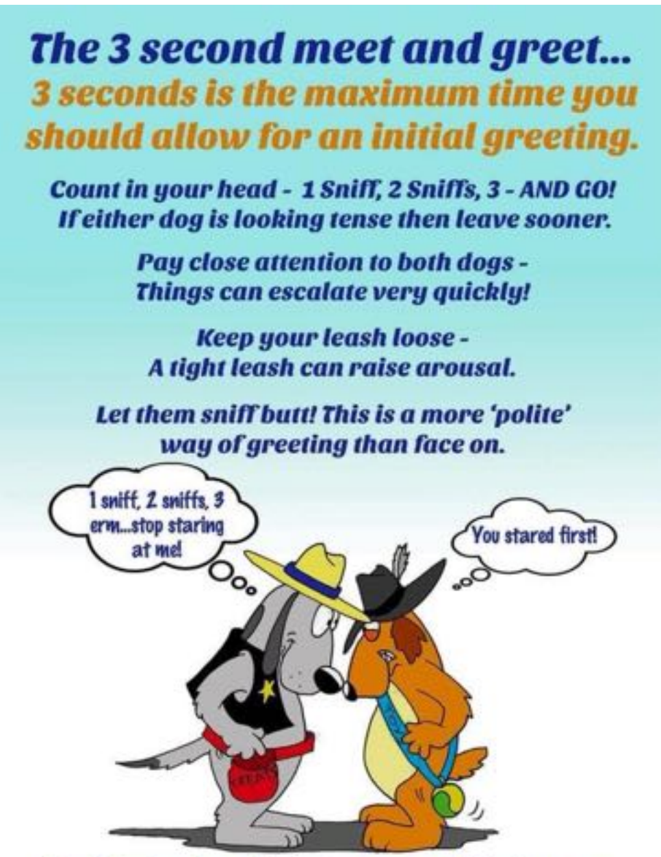
By following these simple steps you can help keep your dog safer and enounters with others a pleasant experience. www.mlghtydoggraphics.com (c) 2017

For all other dogs who are social the following is a great tool for you as well