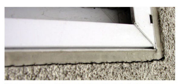
This is an adhesive caulk failure where the caulk remained adhered to the window but disengaged from the EFIS surround.

If you need assistance or guidance on who to call or what to do, please contact Total Property Management for help, (949) 261-8282.