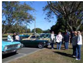
Members gathering at Centenary Lakes prior to departure.