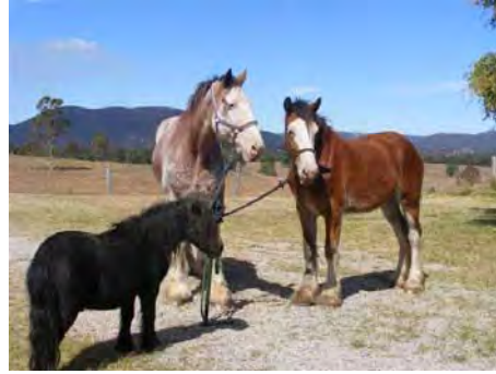
Such magnificent beasts! Gentle giants really.

The property is dedicated to the breeding and history of the magnificent "Clydesdale" horse breed – literally the horse that built Australia. It was explained that virtually every country in the world had its own version of the workhorse, which was essential to the development of agriculture, transport and industry around the world. Of Scottish origin the