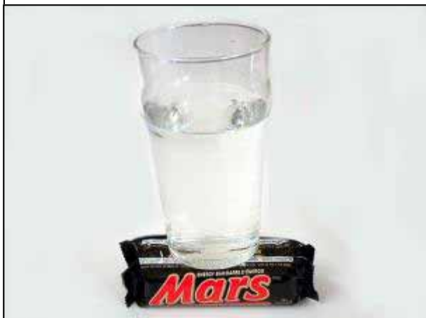
Water on Mars!