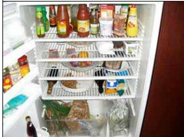
Husband makes lunch - Can you see it?