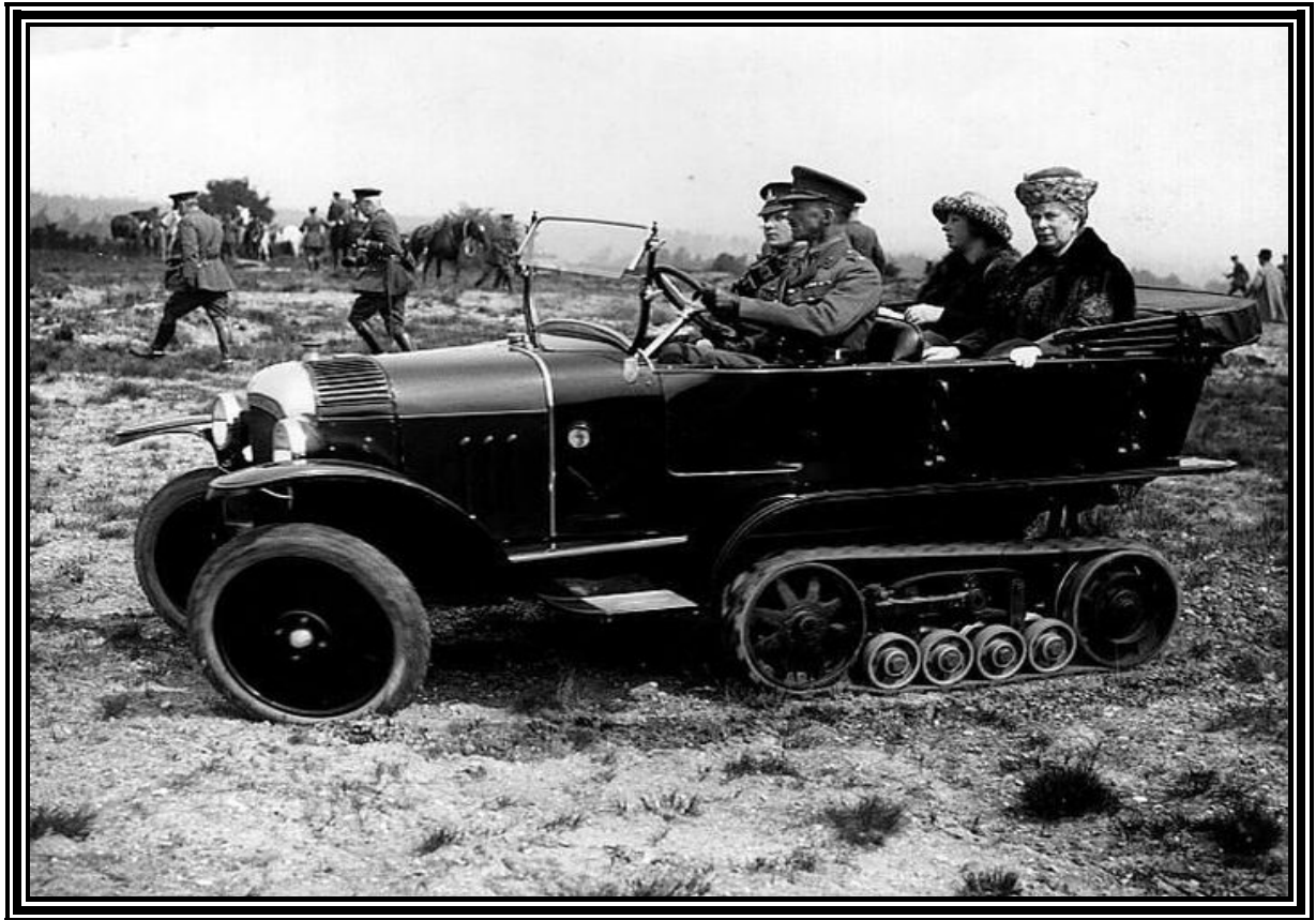
A Half-track car

** Answers to the Frame Games in the last Oily Rag **