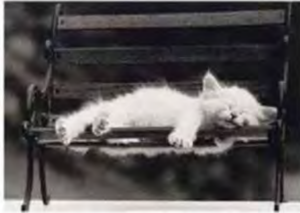
What a week this has been...