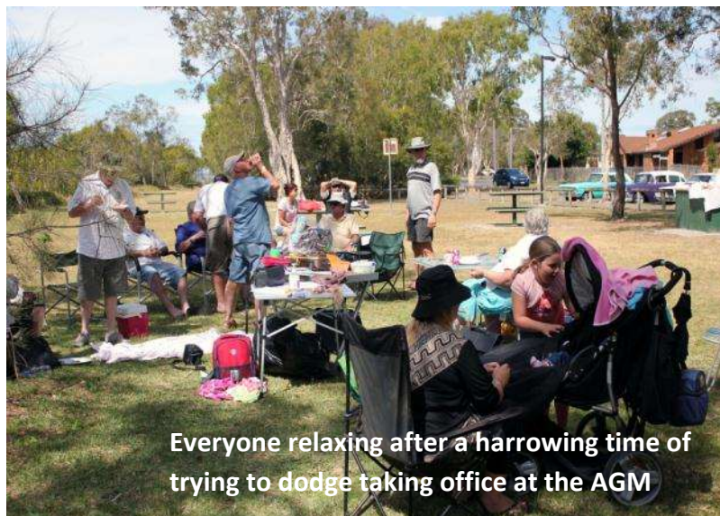
Everyone relaxing after a harrowing time of trying to dodge taking office at the AGM

After meeting up at our usual spot and having the monthly chat, we all headed the short distance to Toorbul waterfront. It was a lovely sunny day with not too much heat which made it ideal for our sausage sizzle smorgasbord.