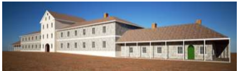
Digital rendition of the Prisoners' Barracks as viewed from the Hungry Jack's corner, Queen Street