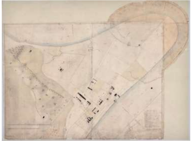
Layout of Brisbane Town, Moreton Bay (now Brisbane CBD)

https://blogs.archives.qld.gov.au/2014/06/06/moreton-bay-penal-settlement-1824-to-1842/