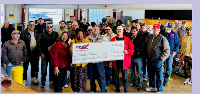
Dealers Auto Auction of Mobile