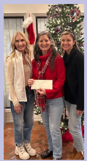
Greek Fest Charity Gala