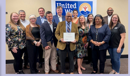
United Way of Southwest Alabama