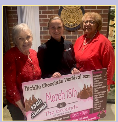
Thais Chapter- Daughters of Penelope