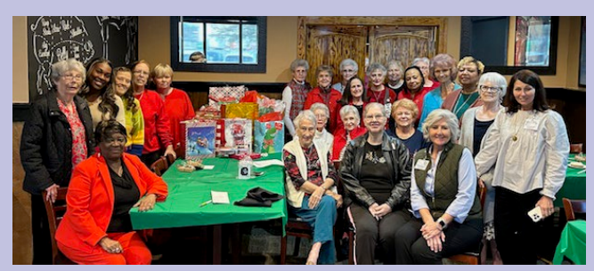
Springhill Medical Auxiliary