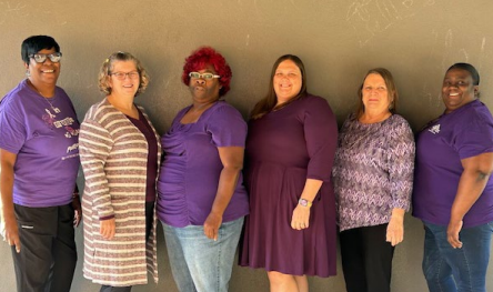
Purple is for DV Awareness