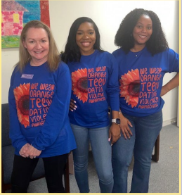
Prevention Education Program