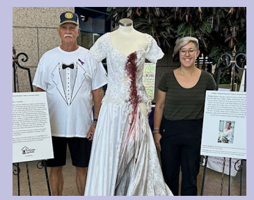
DV Awareness Month Display