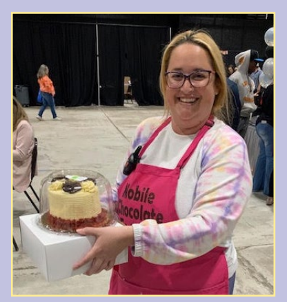
Mobile Chocolate Festival Co-Chair