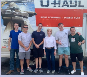
United States Coast Guard Sector Mobile