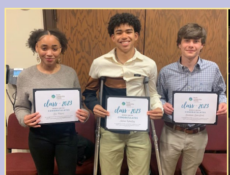
Youth Leadership Mobile- projects for Penelope House

Thank you to so many who held fund raisers for Penelope House, collected items from our Wish List, donated meals, and contributed clothing, small appliances, and artwork to Penelope's Closet- all ways to support Penelope House by generating income and helping us meet the needs of those we serve.