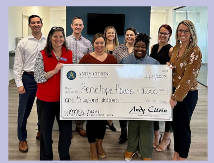
Andy Citrin Injury Attorneys