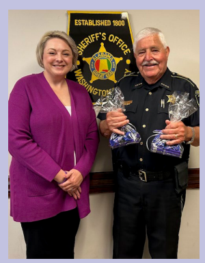
Washington County Sheriff's Office