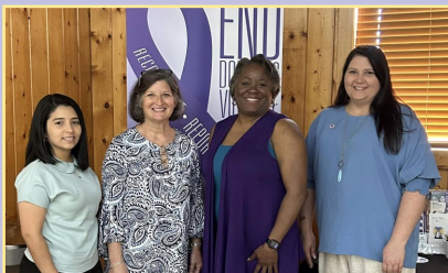
The Lighthouse of Baldwin County- Alabama Coalition Against Domestic Violence

Penelope House is thankful for many community partners