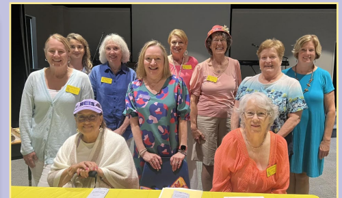
Springhill Baptist Church