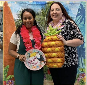
AHEPA Senior Living