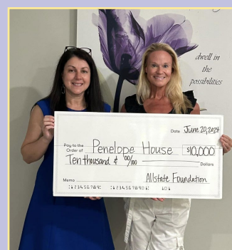
All In Credit Union check presentation