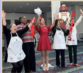
Junior League of Mobile