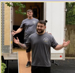
Two Men and a Truck