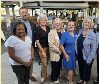
South Alabama Coalition of Nonprofits