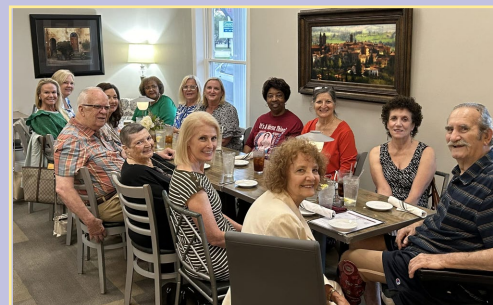
Past Board Presidents Meeting