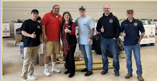
US Marine Corps- Toys for Tots