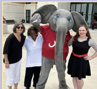
Nick's Kids Foundation