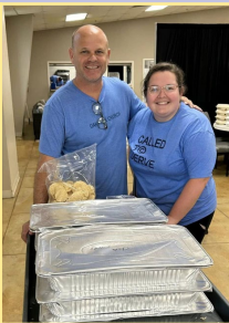
Oak Park Church