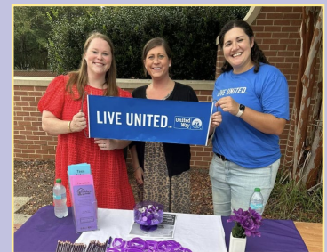
United Way of Southwest Alabama

Penelope House is thankful for many community partners