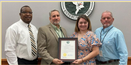
Clarke County Commission