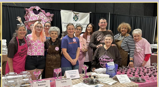
Daughters of Penelope