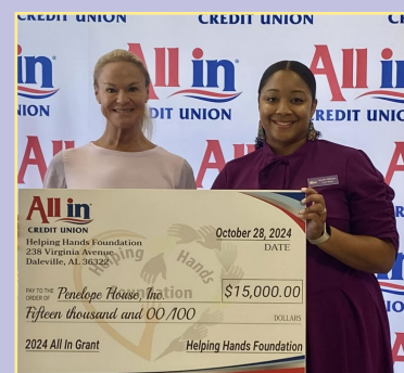
All In Credit Union

Mitchell Charitable Foundation Mobile Airport Authority Fund Nan H. Altmayer Charitable Trust Nick Stratas Chapter 310 AHEPA Nick's Kids Foundation Olzinski Charitable Fund Pinebelt Foundation Shawn Esfahani Foundation Skyros Benevolent Society The Allstate Foundation The Caring Foundation The Daniel Foundation The Miller Charitable Foundation The Moses Foundation