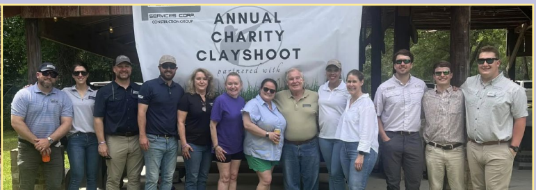
Persons Services Corp Annual Clay Shoot