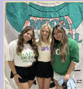
University of South Alabama Kappa Deltas- Mega Musical Chairs