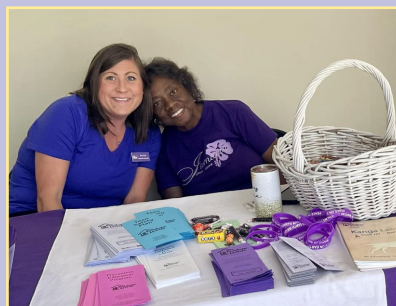
Domestic Violence Education- Community Awareness