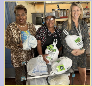
Alabama Power Service Organization- Mobile Chapter