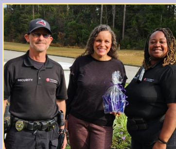
University of Mobile- DV Awareness Month

PENELOPE'S CLOSET: Penelope's Closet is located at 2907 Old Shell Road, Mobile, Alabama. It continues to flourish due to the combination of location, loyal volunteers, donors, and the public. It is absolutely an essential component to our mission. Penelope's Closet provides our clients with clothing and other necessities at no cost. All proceeds from the Closet return to the shelter to further assist victims and their children.