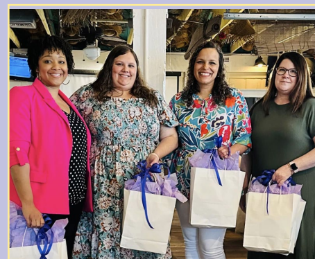
Years of Service Recognized