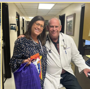
Victory Health Partners