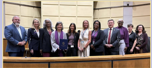
Mobile County Commission- Domestic Violence Task Force