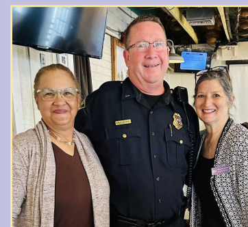
Mobile Police Department