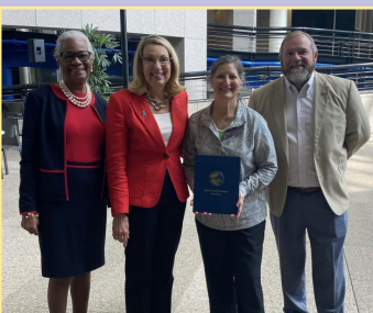
Mobile County Commission