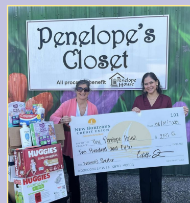
New Horizons Credit Union