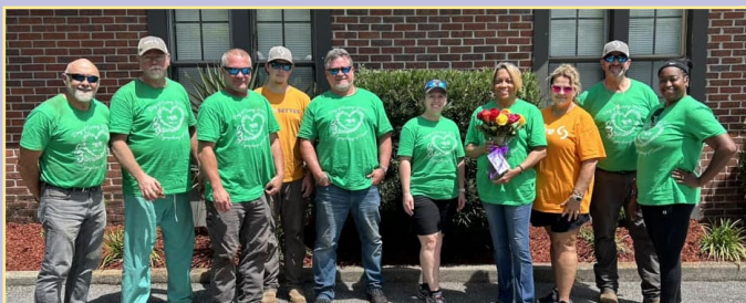
Spire- United Way Day of Caring