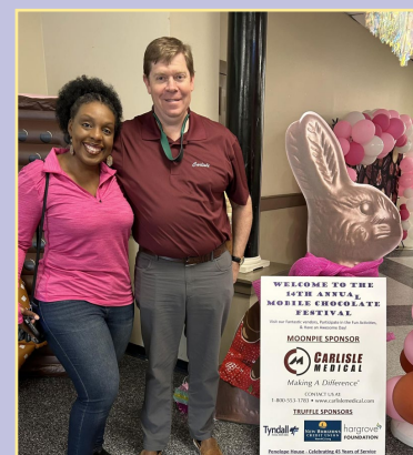
Carlisle Medical MCF Moon Pie Sponsor