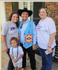
Washington County celebrates American Idol Finalist