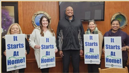
Council Against Family Violence