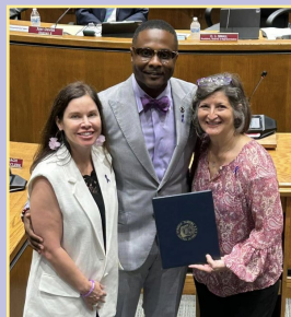
Mobile City Council