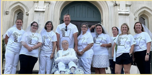
Thais Chapter Daughters of Penelope- Brides March