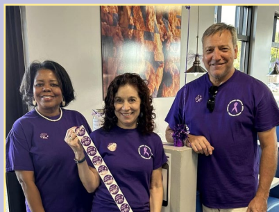
Foosackly's- Kicking off Domestic Violence Awareness Month Fund Raiser