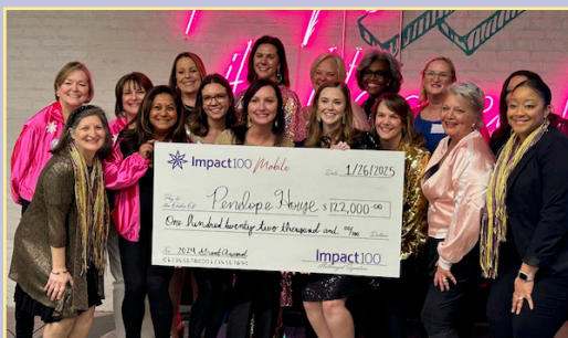
Impact 100 Mobile

PENELOPE'S CLOSET: Penelope's Closet is located at 2907 Old Shell Road, Mobile, Alabama. It continues to flourish due to the combination of location, loyal volunteers, donors, and the public. It is absolutely an essential component to our mission. Penelope's Closet provides our clients with clothing and other necessities at no cost. All proceeds from the Closet return to the shelter to further assist victims and their children.