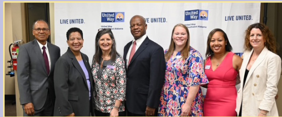
United Way of Southwest Alabama