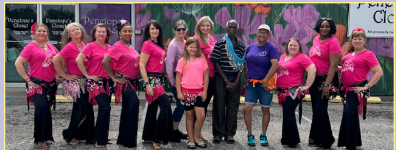
Shimmy Mob at Penelope's Closet