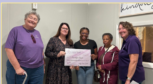
Holy Cross Lutheran Church Lutheran Women In Mission