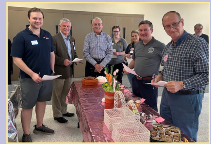
Chocolate Challenge Judges

Megan Montgomery Foundation Mitchell Charitable Foundation Nan H. Altmayer Charitable Trust Nick M. Stratas Chapter 310 - AHEPA Nick's Kids Foundation Penelope 54 Charitable Foundation Shawn Esfahani Foundation Skyros Benevolent Society The Boutzale Family Fund The Daniel Foundation The Moses Foundation Your Barefoot Neighbor/ Gulf Coast Community Foundation