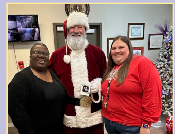
Santa in Shelter