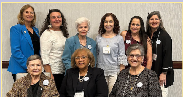
Daughters of Penelope, Thais Chapter, Mobile