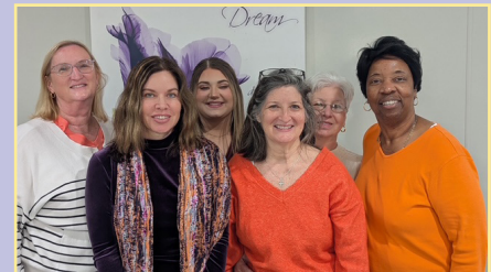
Board Meeting- Orange for Teen Dating Violence Awareness Month