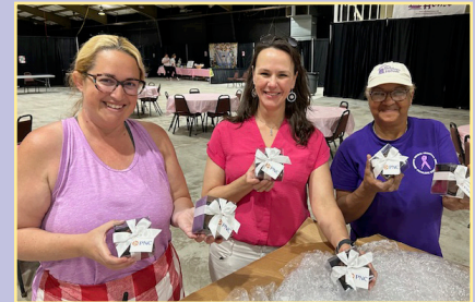
Boxes of chocolate from PNC Bank