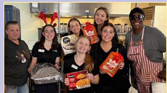
Azalea Trail Maids delivering dinner from the Mobile Jaycees