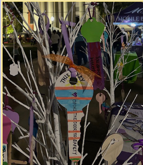
Domestic Violence Awareness Month- "Awareness is Key"

The mission of Penelope House is to provide safety, protection, and support to victims of Domestic Violence and their children through the provision of shelter, advocacy, and individual and community education.