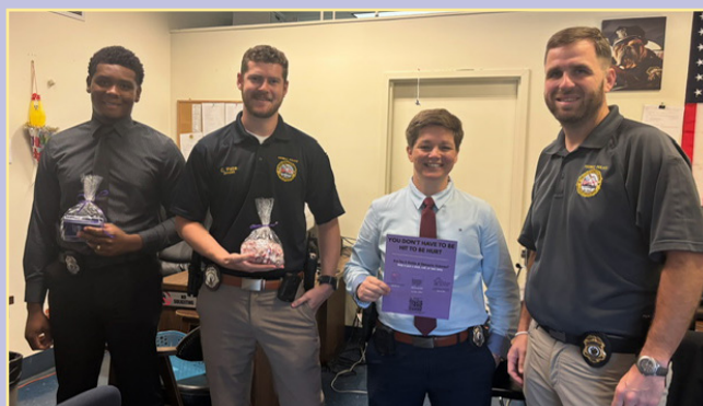
Mobile Police Department- DV Unit