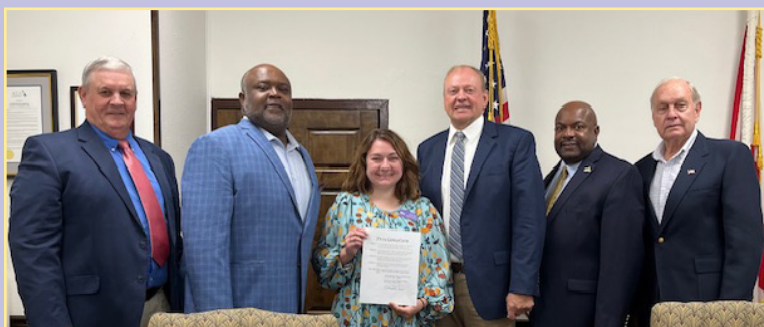
Choctaw County Proclamation- October DV Awareness Month