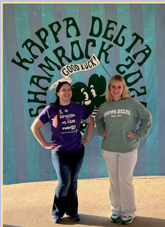
Kappa Delta University of South Alabama

Penelope House thanks the entire community for their support!