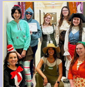
Halloween- Court Advocates