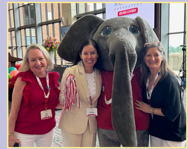
Nick's Kids Foundation