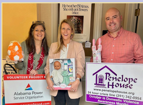
Alabama Service Organization- Mobile Chapter