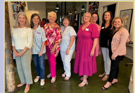
Impact 100 Mobile