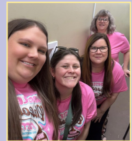
Mobile Chocolate Festival