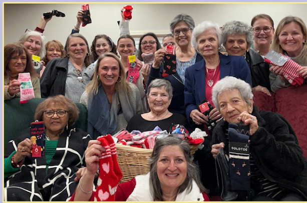
Daughters of Penelope Sock Drive