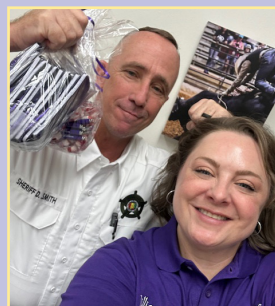
Clarke County Sheriff's Office DV Awareness Month