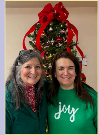
AHEPA PENELOPE DISTRICT 1 Senior Housing, Hoover