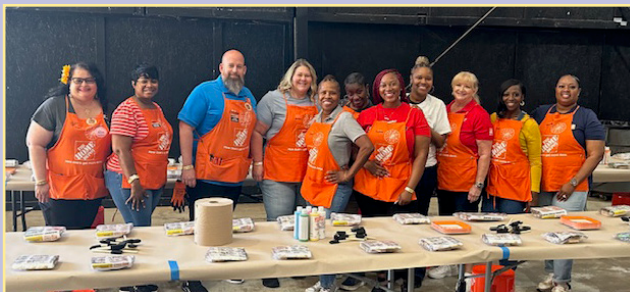
Home Depot- Mobile Chocolate Festival