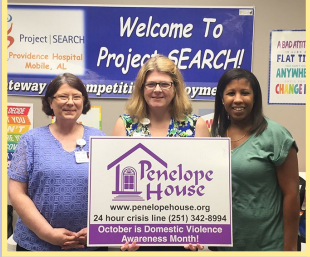
Providence SEARCH Program