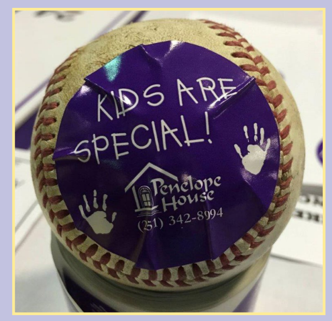
Strike Out Domestic Violence- Mobile BayBears

The mission of Penelope House is to provide safety, protection, and support to the victims of Domestic Violence and their children through the provision of shelter, advocacy, and individual and community education.