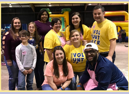
Army Aviation Federal Credit Union

Penelope House thanks the entire Community for their support