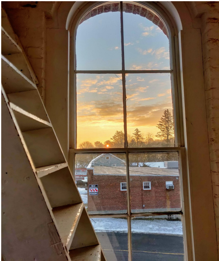
Bell Tower in March!