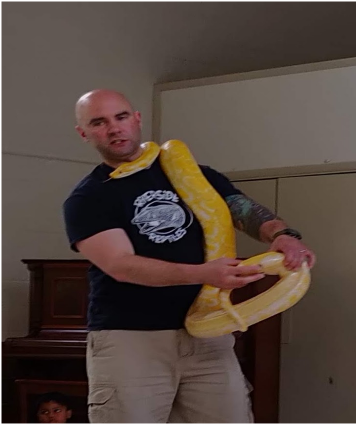
Riverside Reptiles visiting Here Wee Grow!