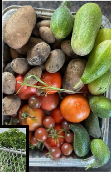
a variety of veggies

Kinew gardeners Jayda, Jayden and Bijou harvested tomato's, cucumbers, lettuce, onions, carrots and potatoes!