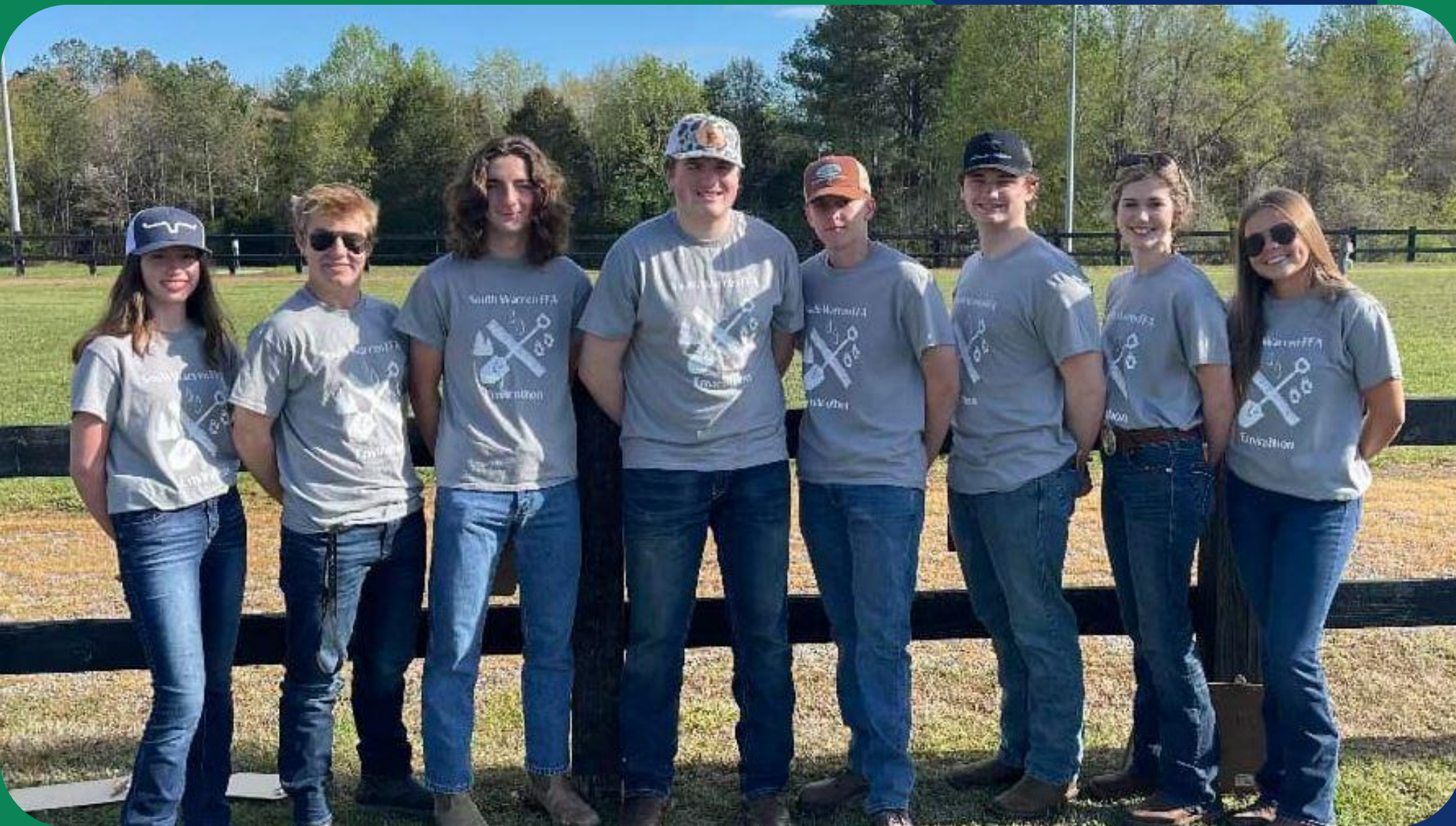
South Warren FFA Envirothon Team - Warren County

Envirothon teams are excellent opportunities to bring together community experts. These groups are important to teaching the teams the knowledge they need to compete. NRCS, Master Gardeners, college or university professors, anyone with soil experience.