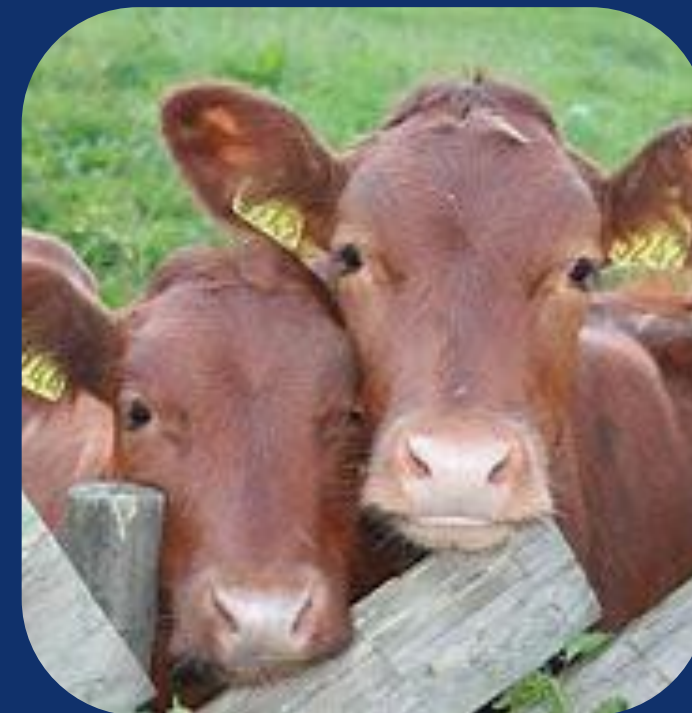
Kentucky Cattlemen's Association