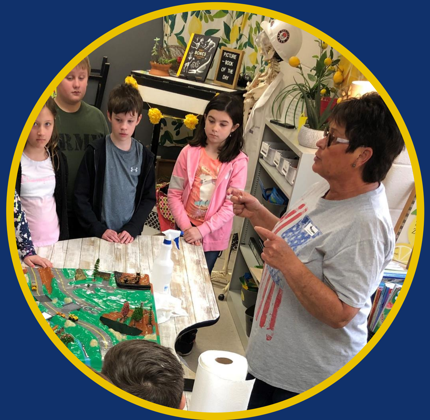
Non-Point Source Pollution class with Partner 4 Rivers Basin Coordinator - Graves County