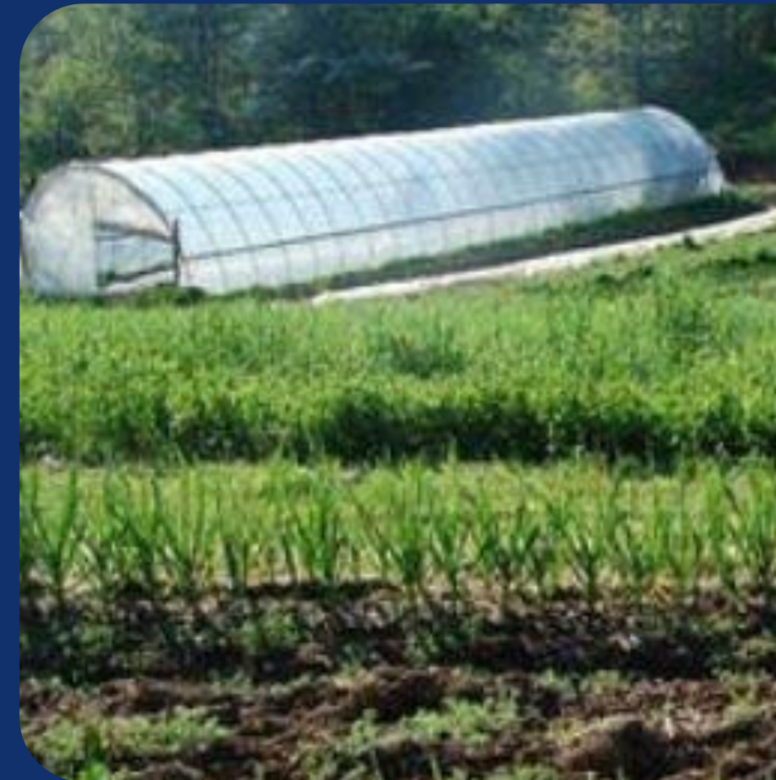
High Tunnel built with Cost-Sharing programs with Parter NRCS - Woodford County

Involving other groups gives you a bigger pool of workers for your project.