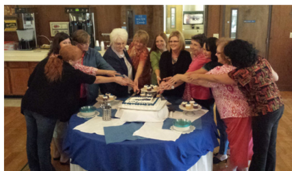
2005- KACDE celebrated 10 years of the annual conference in Jabez!

We hope to see you in Pigeon Forge! It's always a wonderful experience to connect with everyone! The registration deadline has passed for this year, If you're not attending maybe plan for next time!