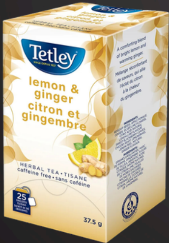
LEMON/GINGER 25 tea bags 15TE130