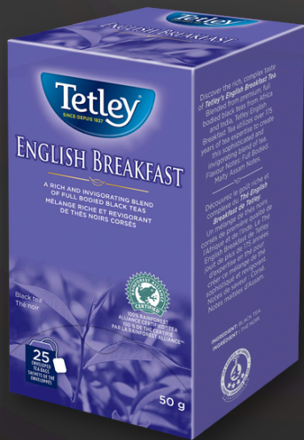
ENGLISH BREAKFAST 25 tea bags 15TE130