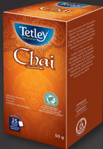
CHAI 25 tea bags 15TE130