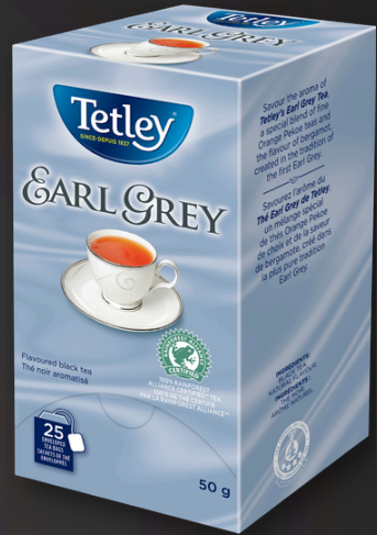
EARL GREY 25 tea bags 15TE130