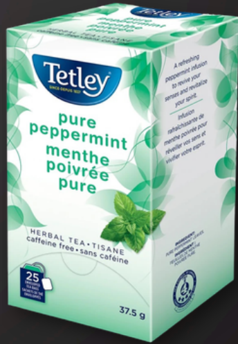
PEPPERMINT 25 tea bags 15TE130