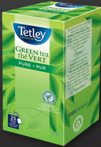
GREEN TEA 25 tea bags 15TE130