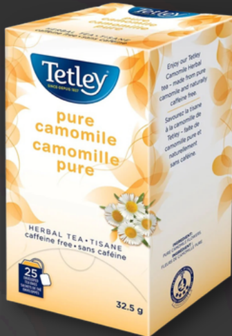
CAMOMILE 25 tea bags 15TE130