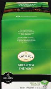
TWINING TEA K CUP GREEN TEA 24 CT 15M1126