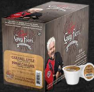
GUY FIERI K CUP CARAMEL APPLE POME CARAMEL BREAD 24 CT 11MI172