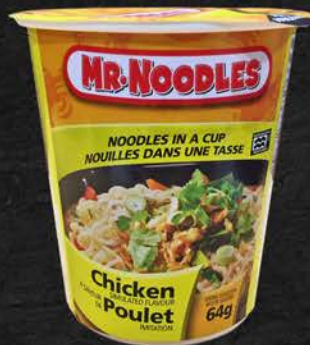
MR NOODLE IN A CUP CHICKEN 12X64 GR 17MN100