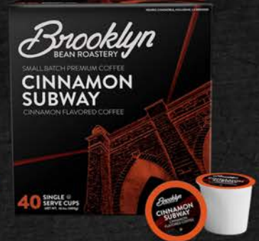
BROOKLYN BEAN CINN SUBWAY 40 CT