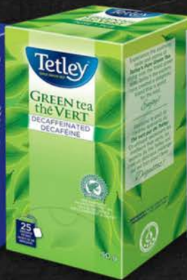
TETLEY TEA ENV DECAF GREEN 25 CT 15TE130