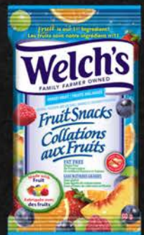
WELCH MIXED FRUIT SNACK 48X60 GR 07MI100