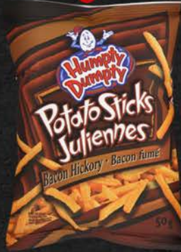
HUM DUMPTY POTATO STIX 42X50 GR 02HD109