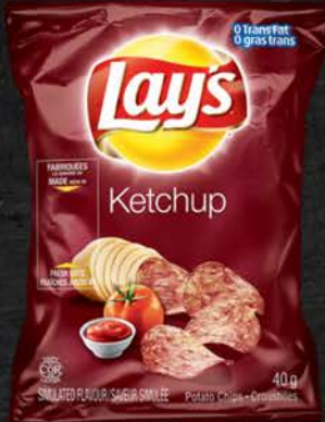
HOS LAYS KETCHUP 40X40 GR 02HO106