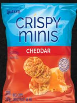
HOS CRISPY MINI BBQ 32X33 GR 02HO170