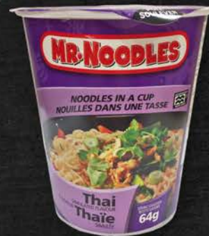
MR NOODLE IN A CUP THAI 12X64 GR 17MN100