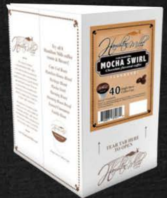
HAMILTON MILLS MOCHA SWIRL 40 CT 11MI344