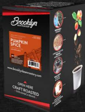
BROOKLYN SEAS PUMPKIN SPICE 40 CT