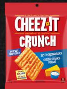
CHEEZ IT CRUNCH ZTY CHED RCH CRACKER 6X92 GR 06KE112