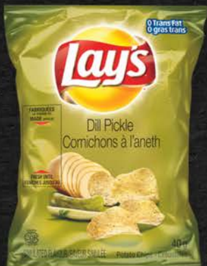
HOS LAYS DILL PICKLE 40X40 GR 02HO106