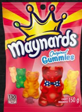
MAYNARD PEG GUMMIES 12X150 GR 07CA148