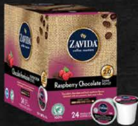
ZAVIDA Z CUPS RASP CHOC DARK ROAST 24 CT 11ZA111