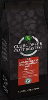
CRAFT ROASTERS (WB) 100% COL RA 2 LB 11CL107