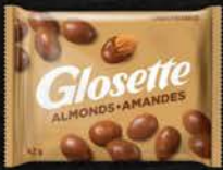
HERSHEY GLOSETTE ALMOND 18X42 GR 03HE167