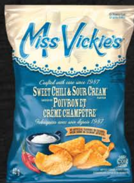
HOS MS VICKIES SWT CHILI & SOUR CRM 40X40 GR 02HO108