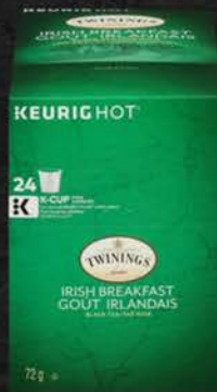
TWINING TEA K CUP IRISH BREAKFAST 24 CT 15M1126