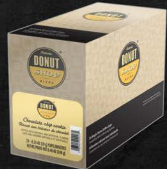
AUTHENTIC DONUT SHOP CHOC CHIP COOKIE 24 CT 11MI168