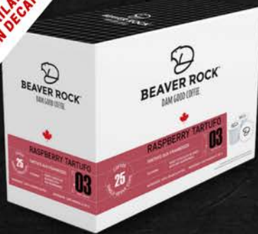
BEAVER ROCK RASP TARTUFO 25 CT 11MI268