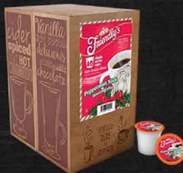
FRIENDLY PEPPERMINT STICK 40 CT