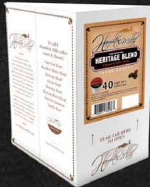
HAMILTON MILLS HERITAGE BLD 40 CT 11MI344