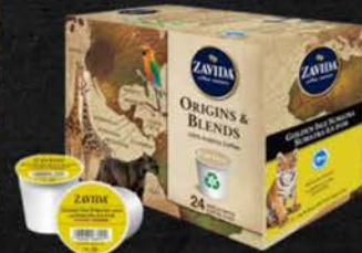
ZAVIDA Z CUPS GOLDEN ISLE SUMATRA 24 CT 11ZA111