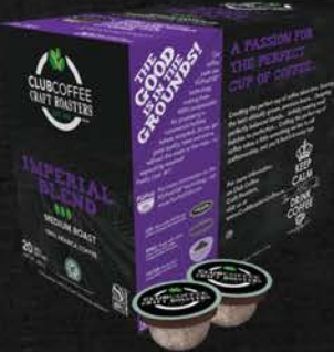
'CRAFT ROASTERS (KC) PURPOD IMPERIAL BLEND 20 CT 11CL111