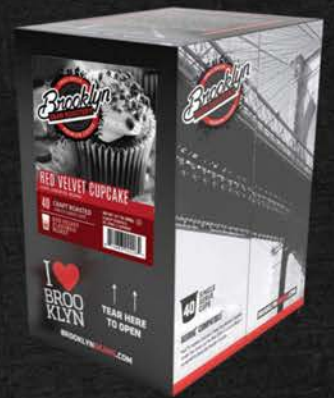
BROOKLYN SEAS RED VELVET CUPCAKE 40 CT