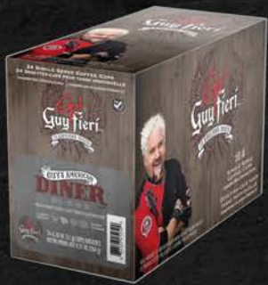
GUY FIERI K CUP AMERICAN DINER BLD 24 CT 11MI172