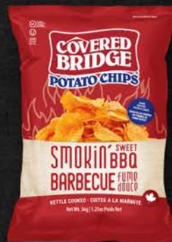
CB KETTLE CHIPS SMOKIN SWT BBQ 24X60 GR 02MI331