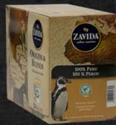
ZAVIDA Z CUPS 100% PERU 24 CT 11ZA111