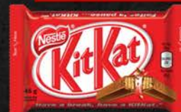
KIT KAT 48x45 GR 03NE109