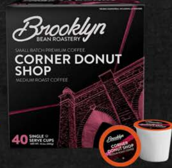
BROOKLYN BEAN CORNER DONUT SHOP 40 CT