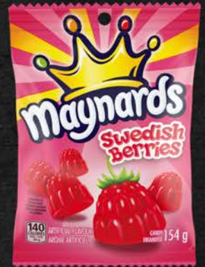
MAYNARD PEG SWEDISH BERRY 12X154 GR 07CA148