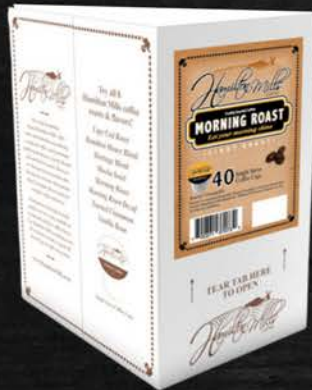
HAMILTON MILLS MORNING ROAST 40 CT 11MI344