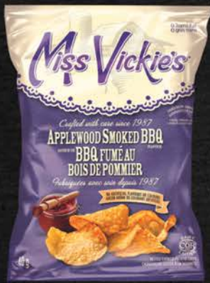
HOS MS VICKIES APPLEWOOD SMKD BBQ 40X40 GR 02HO108