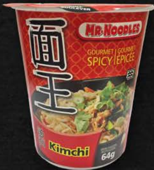
MR NOODLE IN A CUP KIMCHI 12X64 GR 17MN100