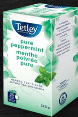
TETLEY TEA ENV PURE PEPPERMINT 25 CT 15TE130