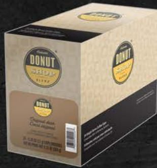
AUTHENTIC DONUT SHOP ORIGINAL DARK 24 CT 11MI168