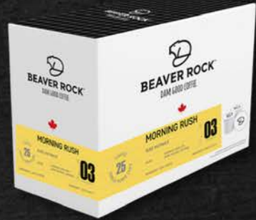
BEAVER ROCK MORNING RUSH 25 CT 11MI268