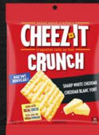
CHEEZ IT CRUNCH WH CHEDDAR CRACKER 6X92 GR 06KE112