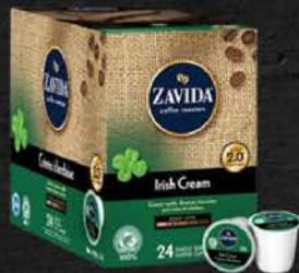
ZAVIDA Z CUPS IRISH CREAM 24 CT 11ZA111