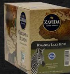
ZAVIDA Z CUPS RWANDA LAKE KIVU 24 CT 11ZA111