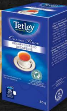
TETLEY TEA ENV DECAF ORANGE PEKOE 25 CT 15TE130