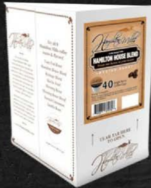
HAMILTON MILLS HAMILTON HOUSE 40 CT 11MI344