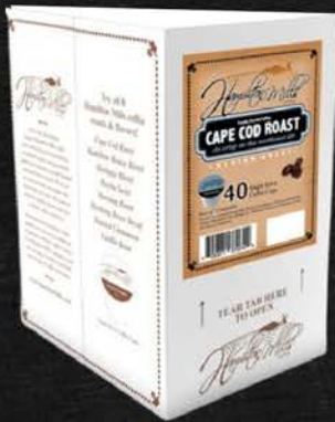
HAMILTON MILLS CAPECOD 40 CT 11MI344