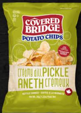
CB KETTLE CHIPS CREAMY DILL 24X60 GR 02MI331