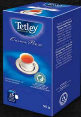
TETLEY TEA ENV ORANGE PEKOE 25 CT 15TE130