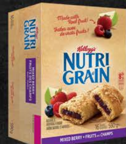
KELL NUTRIGRN MIXED BERRY 16X37 GR 04KE100