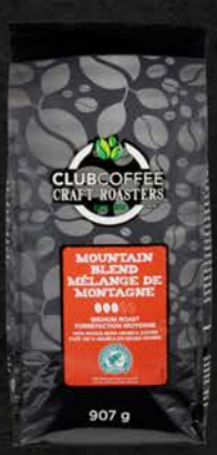
CRAFT ROASTERS (WB) MOUNTAIN RA 2 LB 11CL107