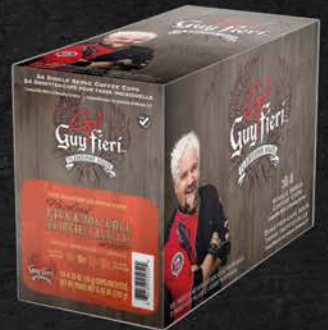
GUY FIERI K CUP CINN HAZELNUT ROLL 24 CT 11MI172