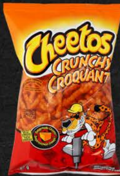
HOS CHEETOS CRUNCHY 40X57 GR 02HO103