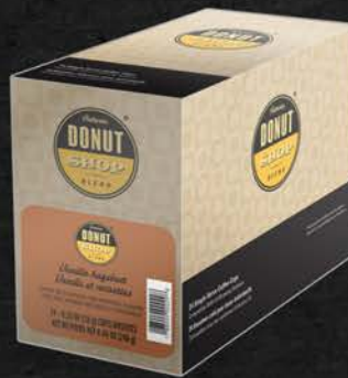
AUTHENTIC DONUT SHOP VANILLA HAZELNUT 24 CT 11MI168