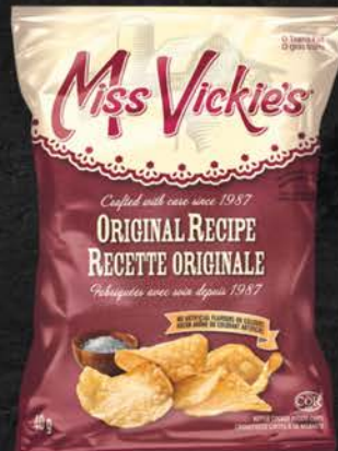
HOS MS VICKIES ORIGINAL 40X40 GR 02HO108