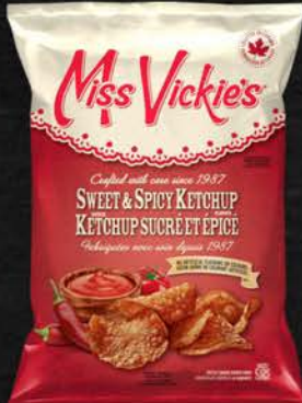
HOS MS VICKIES SWT & SPICY KETCHUP 40X40 GR 02HO108