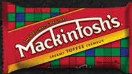
MACKINTOSH TOFFEE BAR 24X45 GR 03NE192