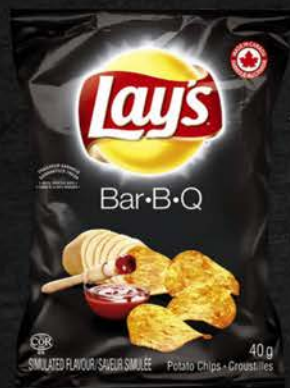
HOS LAYS BBQ 40X40 GR 02HO106