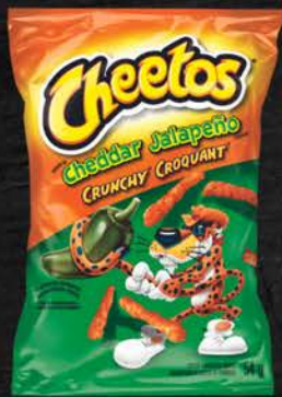
HOS CHEETOS CHED JALAPENO 40X54 GR 02HO189