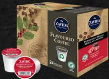
ZAVIDA Z CUPS P/MINT MOCHA 24 CT 11ZA111