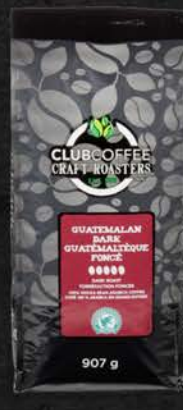
CRAFT ROASTERS (WB) GUATEMALAN DARK RA 2 LB 11CL107