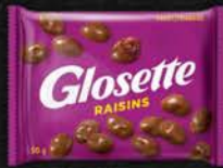
HERSHEY GLOSETTE RAISIN 18X50 GR 03HE169