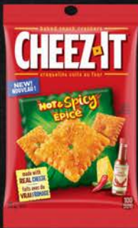
CHEEZ IT HOT & SPICY CRACKER 6X85 GR 06KE110