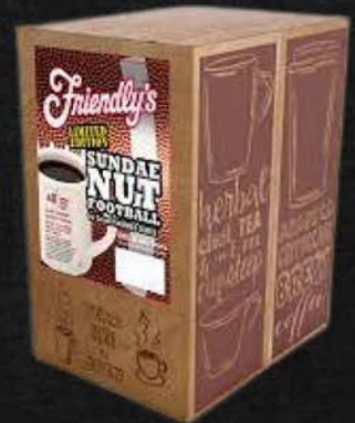
FRIENDLY SUNDAY NUT FOOTBALL 40 CT