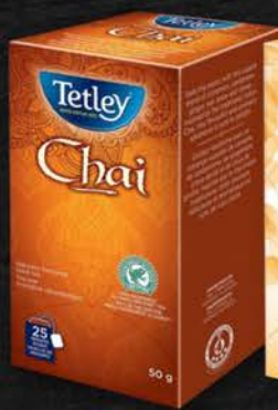
TETLEY TEA ENV CHAI 25 CT 15TE130