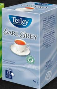
TETLEY TEA ENV EARL GREY 25 CT 15TE130