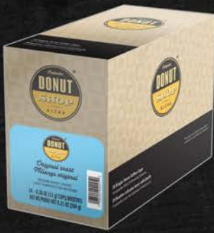
AUTHENTIC DONUT SHOP ORIGINAL ROAST 24 CT 11MI168