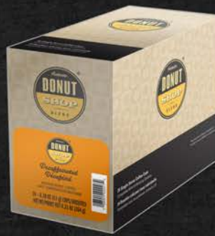
AUTHENTIC DONUT SHOP DECAF 24 CT 11MI168