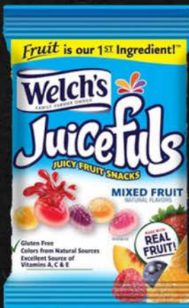
WELCH JUICEFULS 12X115 GR 07MI400