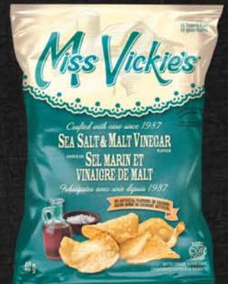
HOS MS VICKIES S&M VINEGAR 40X40 GR 02HO108