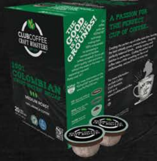
'CRAFT ROASTERS (KC) PURPOD 100% SWD RA 20 CT 11CL111