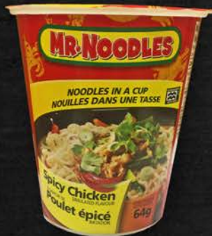
MR NOODLE IN A CUP SPICY CHICKEN 12X64 GR 17MN100