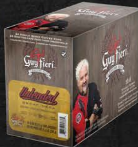
GUY FIERI K CUP UNLEADED DECAF 24 CT 11MI172