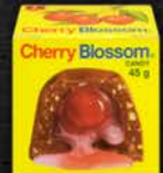
HERSHEY CHERRY BLOSSOM 24X45 GR 03HE191