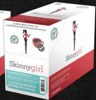
SKINNYGIRL AMERICANO 24 CT 11MI191