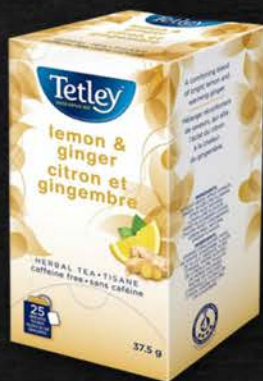
TETLEY TEA ENV LEMON GINGER 25 CT 15TE130