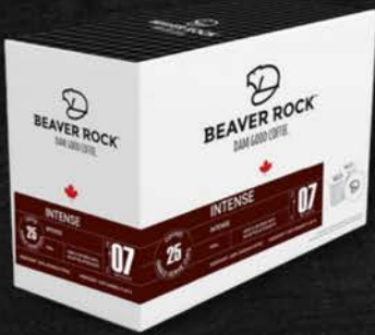
BEAVER ROCK INTENSE 25 CT 11MI268