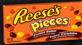
HERSHEY REESE'S PIECES 18X51 GR 03HE207