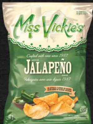
HOS MS VICKIES JALAPENO 40X40 GR 02HO108