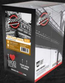
BROOKLYN BEAN DECAF CI CARAMEL 40 CT 11M1341