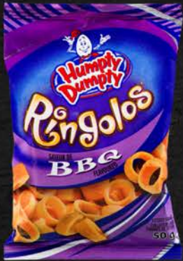
HUM DUMPTY BBQ RINGOLOS 49X50 GR 02HD107