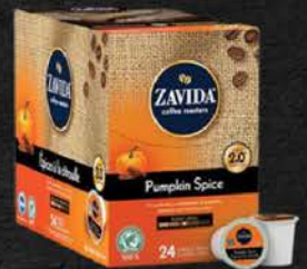
ZAVIDA Z CUPS PUMPKIN SPICE 24 CT 11ZA111