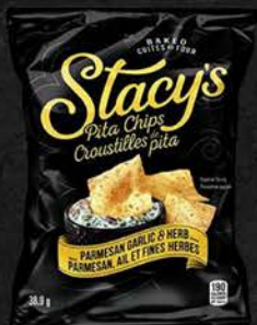
HOS STACY'S PARM GARLIC & HERB 40X38.9 GR 02HO156