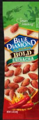
BLUE DIAMOND SRIRACHA 12X43 GR 05M1226