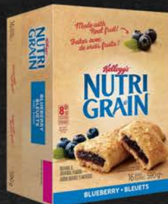
KELL NUTRIGRN BLUEBERRY 16X37 GR 04KE100