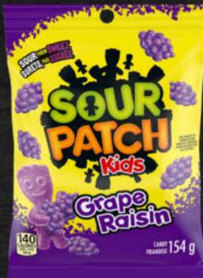
MAYNARD PEG SPK GRAPE 12X154 GR 07CA148