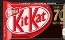
KIT KAT DARK 70% 24X41 GR 03NE193