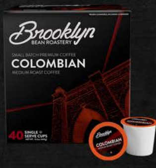
BROOKLYN BEAN COLOMBIAN 40 CT