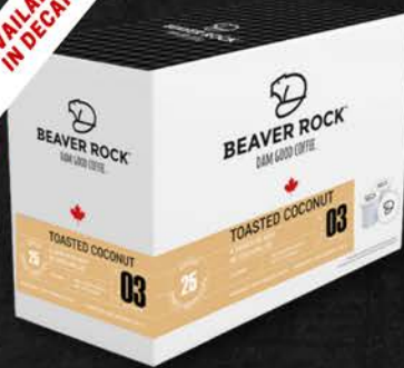
BEAVER ROCK TOASTED COCONUT 25 CT 11MI268