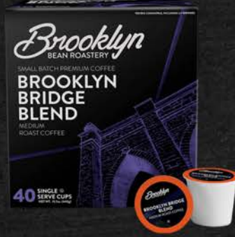
BROOKLYN BEAN BROOKLYN BRIDGE BLD 40 CT