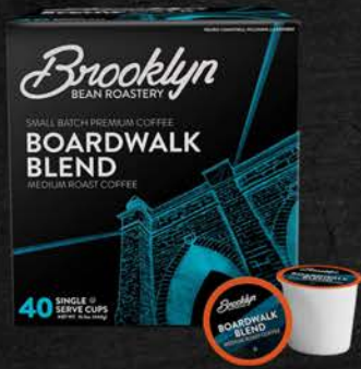
BROOKLYN BEAN BOARDWALK BLD 40 CT