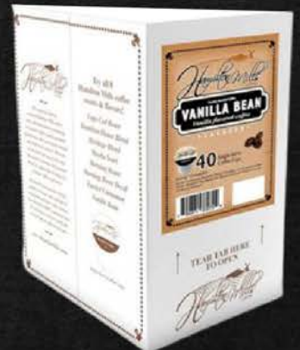
HAMILTON MILLS VANILLA BEAN 40 CT 11MI344