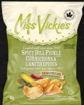
HOS MS VICKIES SPICY DILL 40X40 GR 02HO108