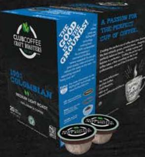
'CRAFT ROASTERS (KC) PURPOD 100% COLOMBIAN 20 CT 11CL111