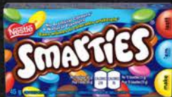
SMARTIES 24X45 GR 03NE190