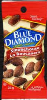
BLUE DIAMOND SMOKEHOUSE ALMD 18X23 GR 05M1124