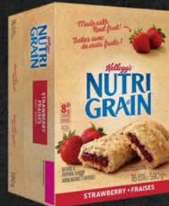
KELL NUTRIGRN STRAWBERRY 16X37 GR 04KE100