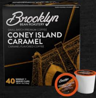
BROOKLYN BEAN CONEY ISLAND CARAMEL 40 CT