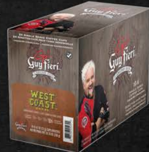
GUY FIERI K CUP WEST COAST ROAST 24 CT 11MI172