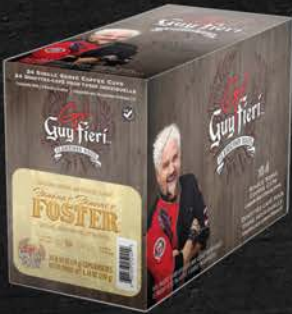
GUY FIERI K CUP BANANAS FOSTER 24 CT 11MI172