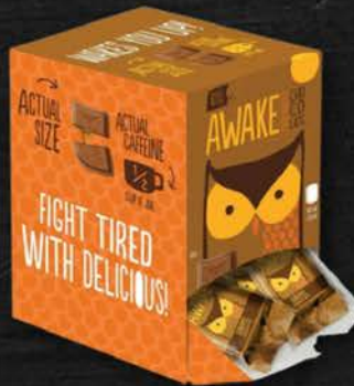
AWAKE CHANGEMAKER CARAMEL BITES 50X15 GR 03MI185

Regular Price $28.63 Discount $2.46 *While quantities last*