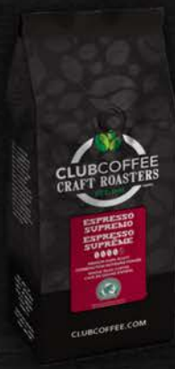
CRAFT ROASTERS (WB) ESPRESSO SUP RA 2 LB 11CL107