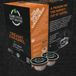
'CRAFT ROASTERS (KC) PURPOD CREAMY CARAMEL RA 20 CT 11CL111