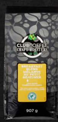
CRAFT ROASTERS (WB) BREAKFAST RA 2 LB 11CL107