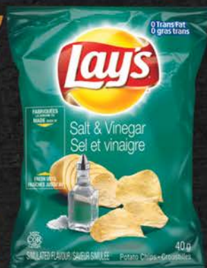
HOS LAYS S & V 40X40 GR 02HO106