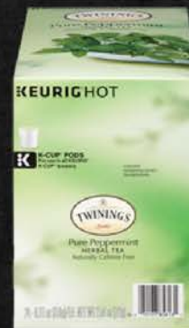
TWINING TEA K CUP PEPPERMINT 24 CT 15M1126