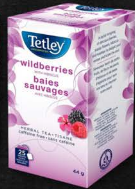
TETLEY TEA ENV WILDBERRIES 25 CT 15TE130