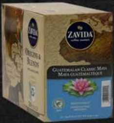
ZAVIDA Z CUPS GUATEMALAN 24 CT 11ZA111