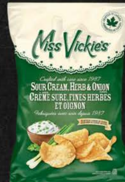
HOS MS VICKIES SR CRM HERB & ONION 40X40 GR 02HO108