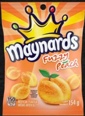
MAYNARD PEG FUZZY PEACH 12X154 GR 07CA148