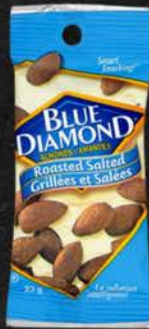
BLUE DIAMOND RST SLTD ALMOND 18X23 GR 05M1134