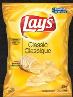
HOS LAYS REGULAR 40X40 GR 02HO106