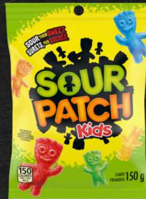
MAYNARD PEG SR PATCH KIDS 12X150 GR 07CA148