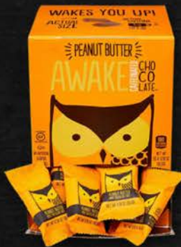
AWAKE CHANGEMAKER PEANUT BUTTER 50X15 GR 03MI184