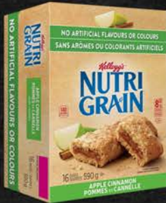
KELL NUTRIGRN APPLE CINNAMON 16X37 GR 04KE100