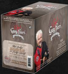
GUY FIERI K CUP HOT FUDGE BROWNIE 24 CT 11MI172