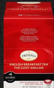
TWINING TEA K CUP ENGLISH BREAKFAST 24 CT 15M1126