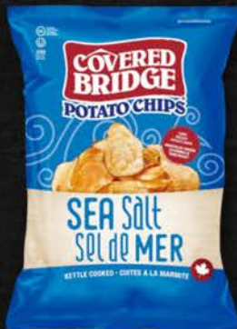
CB KETTLE CHIPS SEA SALT 24X60 GR 02MI331