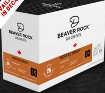
BEAVER ROCK KOFFEE KRISP 25 CT 11MI268