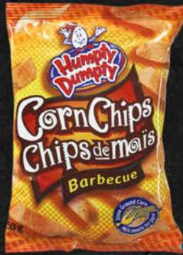
HUM DUMPTY BBQ CORN CHIPS 49X50 GR 02HD120