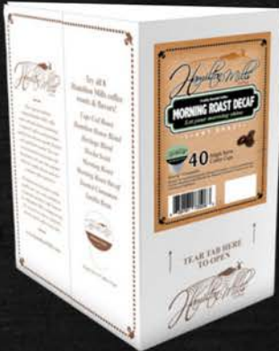
HAMILTON MILLS MORNING RST DECAF 40 CT 11MI344