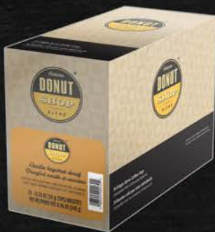
AUTHENTIC DONUT SHOP VAN HAZELNUT DECAF 24 CT 11MI168