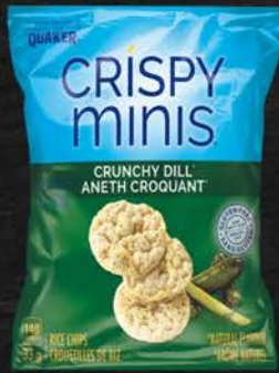
HOS CRISPY MINI CRUNCHY DILL 32X33 GR 02HO170