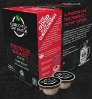
'CRAFT ROASTERS (KC) PURPOD FR ROAST RA 20 CT 11CL111