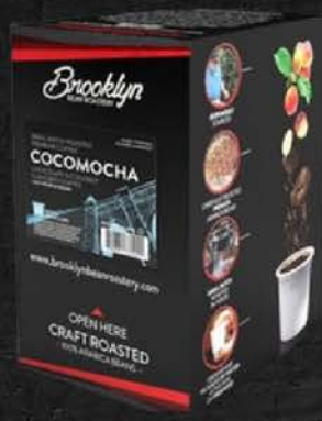
BROOKLYN SEAS COCAMOCHA 40 CT