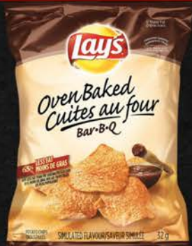
HOS BAKED LAYS BBQ 40X32 GR 02HO155