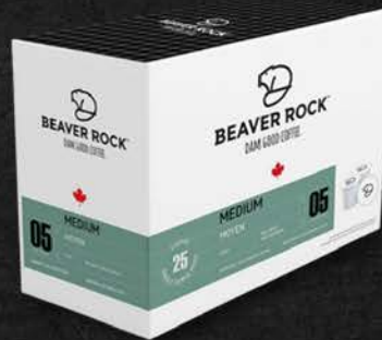
BEAVER ROCK MEDIUM RST 25 CT 11MI268