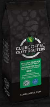
CRAFT ROASTERS (WB) SWD COL 2 LB 11CL107