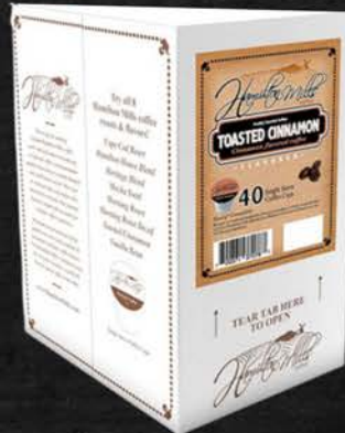
HAMILTON MILLS TOASTED CINNAMON 40 CT 11MI344