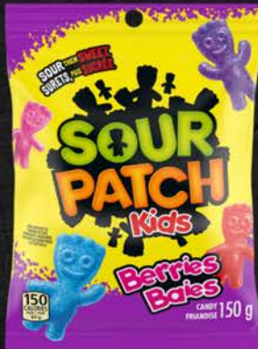
MAYNARD PEG SPK BERRIES 12X150 GR 07CA148