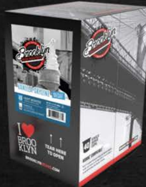
BROOKLYN BEAN DECAF VAN SKYLINE 40 CT 11M1341