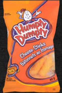
HUM DUMPTY CHEESE STIX 42X40 GR 02HD111