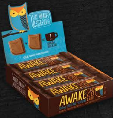
AWAKE MILK CHOC 2 PK BITES 12X30 GR 03MI163