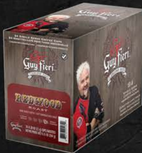
GUY FIERI K CUP REDWOOD RST 24 CT 11MI172