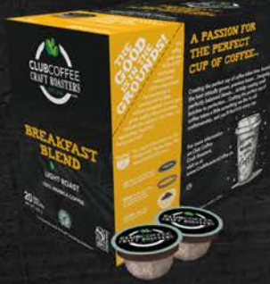
'CRAFT ROASTERS (KC) PURPOD BREAKFAST RA 20 CT 11CL111