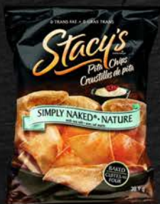
HOS STACY'S NAKED 40X38.9 GR 02HO156