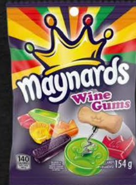
MAYNARD PEG WINE GUM 12X154 GR 07CA148