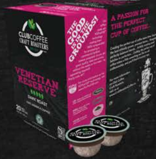
'CRAFT ROASTERS (KC) PURPOD VENETIAN RES RA 20 CT 11CL111