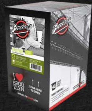
BROOKLYN BEAN DECAF HAZELNUT 40 CT 11M1341