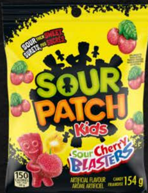
MAYNARD PEG SR CHERRY BLASTER 12X154 GR 07CA148