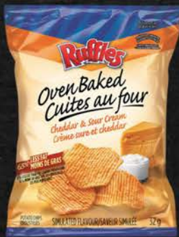
HOS BAKED RUFFLES SOUR CREAM & CHEDDAR 40X32 GR 02HO137