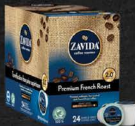
ZAVIDA Z CUPS PREMIUM FRENCH ROAST 24 CT 11ZA111