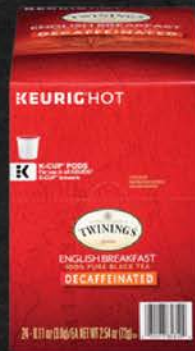
TWINING TEA K CUP ENG BREAKFAST DECAF 24 CT 15M1126