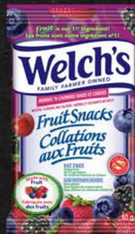
WELCH BERRIES N CHERRIES FRUIT SNACK 48X60 GR 07MI100