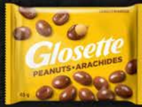
HERSHEY GLOSETTE PEANUT 18X42 GR 03HE168