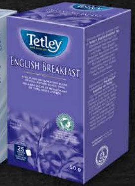
TETLEY TEA ENV ENGLISH BREAKFAST 25 CT 15TE130