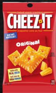
CHEEZ IT ORIG CRACKER 6X85 GR 06KE110