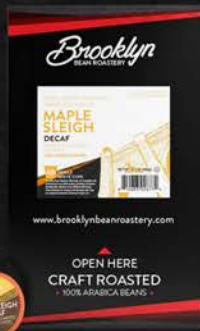
BROOKLYN BEAN DECAF MPL SLEIGH 40 CT 11M1341