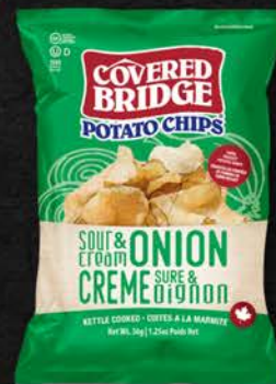
CB KETTLE CHIPS SR CREAM & ONION 24X60 GR 02MI331