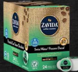
ZAVIDA Z CUPS SWISS WATER DECAF 24 CT 11ZA111