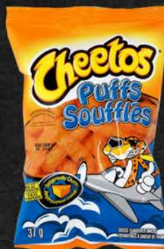
HOS CHEETOS PUFFS 40X37 GR 02HO104