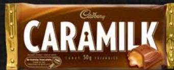
CADBURY CARAMILK 48X50 GR 03CA100