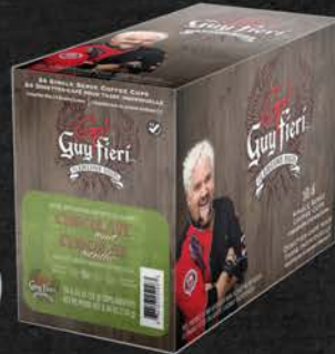
GUY FIERI K CUP CHOCOLATE MINT 24 CT 11MI172