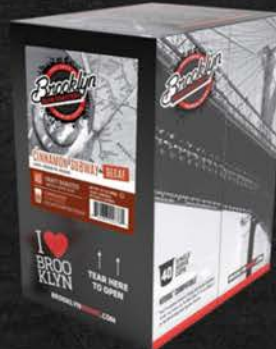
BROOKLYN BEAN DECAF CINN SUBWAY 40 CT 11M1341