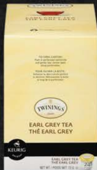
TWINING TEA K CUP EARL GREY 24 CT 15M1126