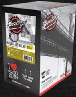
BROOKLYN BEAN BREAFAST BLD DECAF 40 CT 11M1341