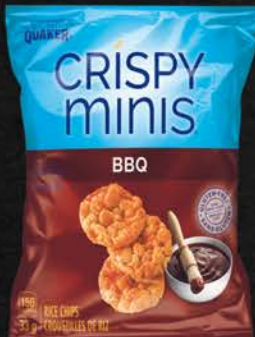
HOS CRISPY MINI CHEDDAR CHEESE 32X33 GR 02HO170