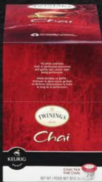
TWINING TEA K CUP CHAI 24 CT 15M1126