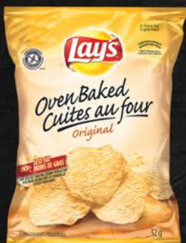
HOS BAKED LAYS REG 40X32 GR 02HO107