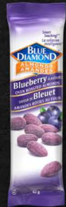
BLUE DIAMOND BLUEBERRY 12X43 GR 05M1224