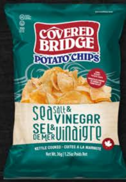
CB KETTLE CHIPS SEA SALT & VINEGAR 24X60 GR 02MI331