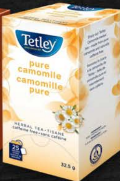
TETLEY TEA ENV CHAMOMILE 25 CT 15TE130