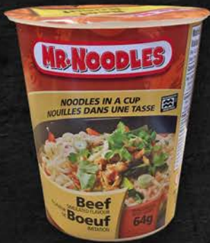
MR NOODLE IN A CUP BEEF 12X64 GR 17MN100