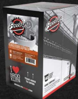
BROOKLYN SEAS GINGERBREAD MAN 40 CT