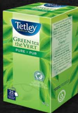
TETLEY TEA ENV PURE GREEN 25 CT 15TE130