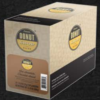
AUTHENTIC HOT CHOC 24 CT 13MI126