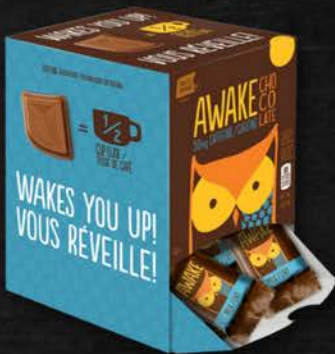
AWAKE CHOC BITES 50X15 GR 03MI162