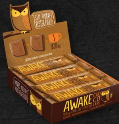
AWAKE CHOC CARAMEL 2 PK BITES 12X30 GR 03MI165