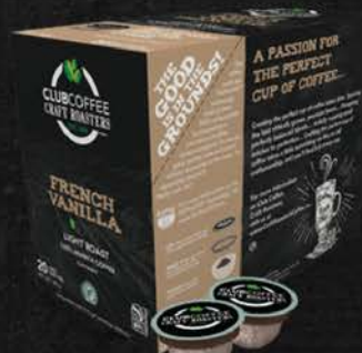
'CRAFT ROASTERS (KC) PURPOD FR VANILLA RA 20 CT 11CL111