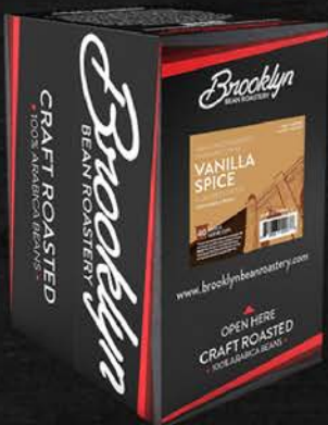
BROOKLYN SEAS VANILLA SPICE 40 CT