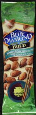
BLUE DIAMOND WASABI & SOY 12X43 GR 05M1225