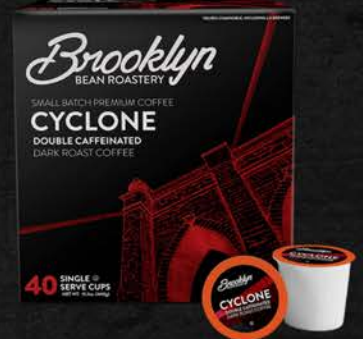
BROOKLYN BEAN CYCLONE 40 CT