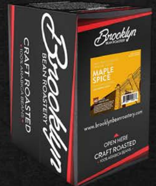
BROOKLYN SEAS MAPLE SPICE 40 CT 11M1341