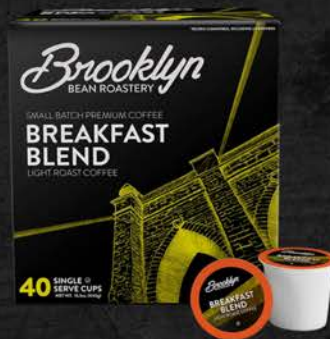
BROOKLYN BEAN BREAKFAST BLD 40 CT