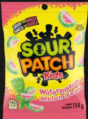
MAYNARD PEG SPK WATERMELON 12X154 GR 07CA148