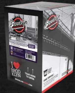
BROOKLYN BEAN FUHGEDDABOUTIT DECAF 40 CT 11M1341