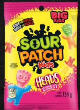
MAYNARD PEG SPK BIG HEADZ 12X154 GR 07CA148