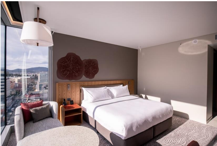
1 King Premium Corner