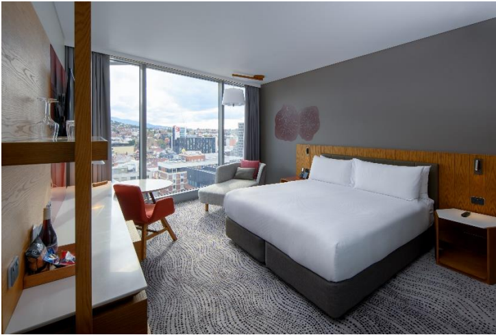
1 King Standard