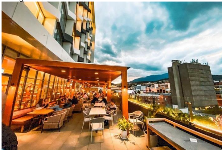
THE DECK (Level 4)