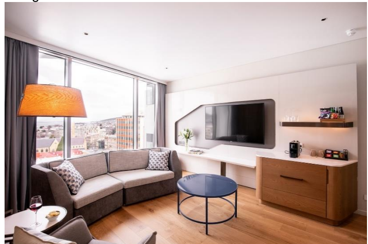
1 King 1 Bedroom Suite Club