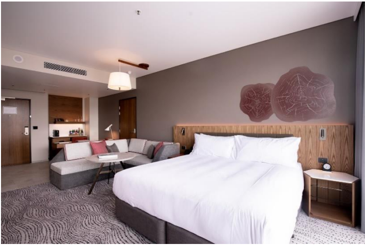
1 King Junior Suite Club with City View