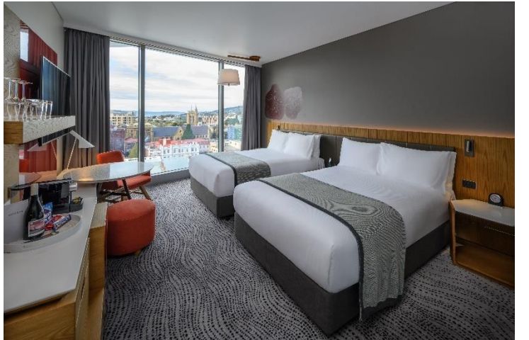
2 Double Standard Club