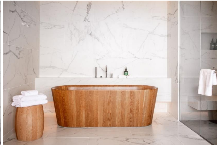
1 King 1 Bedroom Derwent Suite