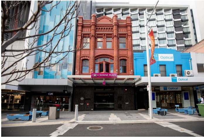
Crowne Plaza Hobart