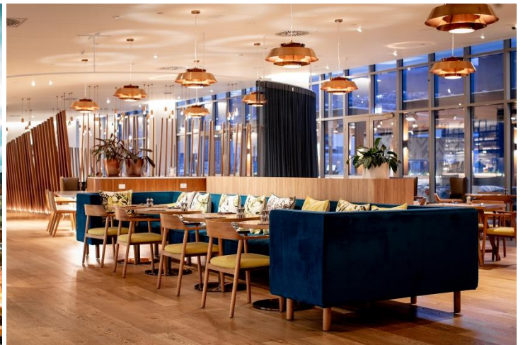
Core restaurant and bar (Level 4)