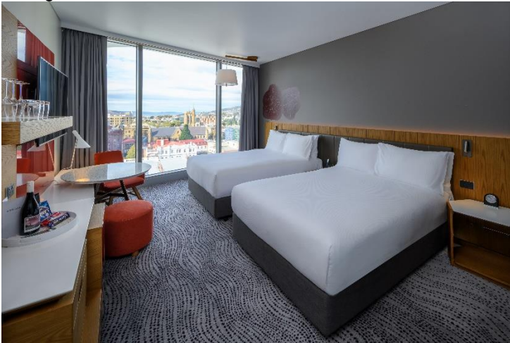
2 Double Standard