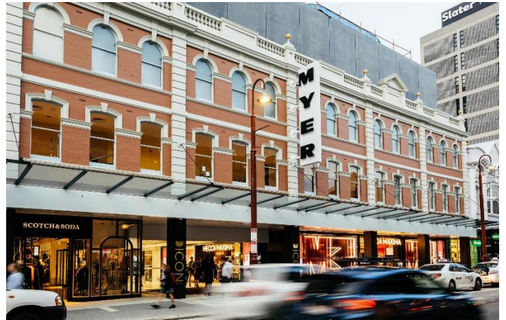
Historic Murray Street & Icon Complex