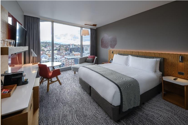
1 King Standard Club