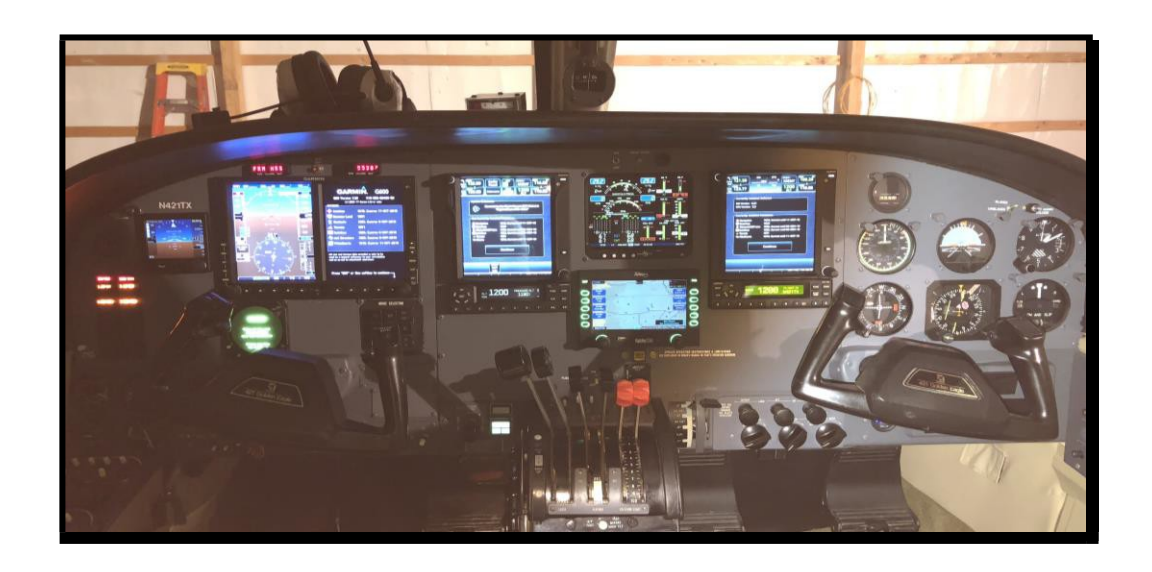
Garmin Touchscreen Glass Panel with Avidyne MFD, JPI Digital Engine Monitoring & L-3 Standby Instruments