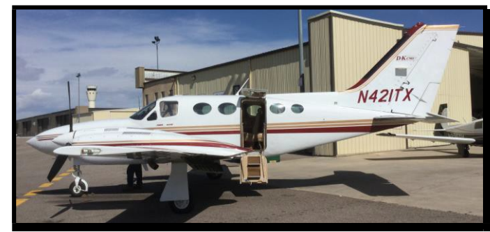
Beautiful Exterior Finish, Boots in Excellent Condition