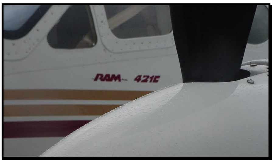
RAM Modified with Gross Weight Increase to 7610 Lbs

<u>Very Thorough Records including FAA 337s, STCs, even FAA Microfiche Records; Airframe Log up to 1993</u> <u>Reconstructed with Work Orders</u>