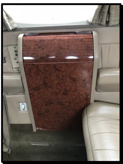
Beautiful Cherry Wood Finished Forward Refreshment Center (with electric coffee dispenser), Chart Storage and dual Executive Writing Tables