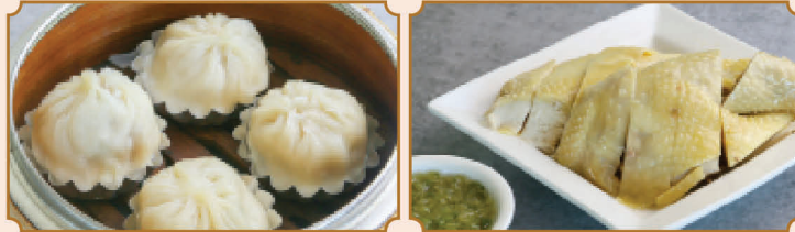
—— 上海小籠包 (B) 101 Shanghai Mini Dumplings —— 貴妃黃毛雞 (G) 103 Empress Chicken