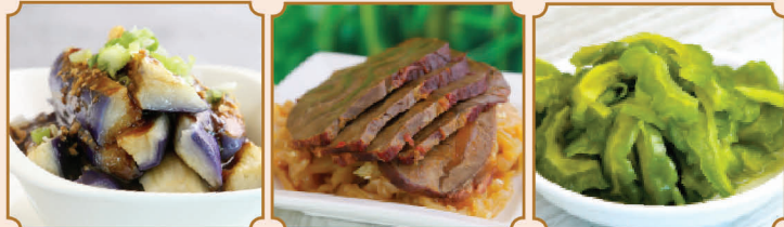
—— 醬茄子 (Cold) (M) 211 Marinated Spicy Eggplant —— 海蜇五香牛展 (B) 110 Spicy Beef Shank & Jelly Fish —— 甜酸涼瓜 (M)* 111 Shredded Bitter Melon Pickle*