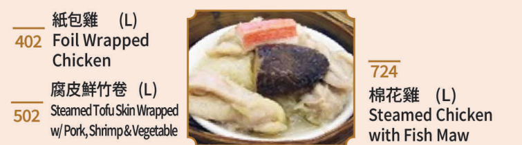
—— 紙包雞 (L) 402 Foil Wrapped Chicken —— 腐皮鮮竹卷 (L) 502 Steamed Tofu Skin Wrapped w/ Pork, Shrimp & Vegetable 724 棉花雞 (L) Steamed Chicken with Fish Maw