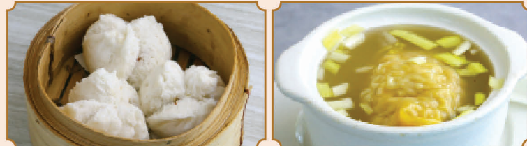
—— 蝦皇叉燒包 (S) 506 Steamed Barbecued Pork Buns —— 蟹肉灌湯餃 (B) 301 Crab Meat Soup Dumpling w/ Shrimp & Pork