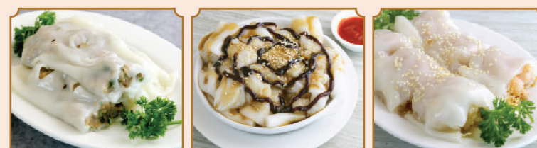
—— 牛肉腸粉 (L) 310 Rice Noodle Stuffed w/ Beef —— 大排檔腸粉 (B)* 709 Hong Kong-Style Rice Noodle w/ Peanut Soy Sweet Sauce Topped w/ Sesame* —— 金沙腸粉 (G)* 718 Crispy Golden Rice Noodle Stuffed w/ Shrimp*