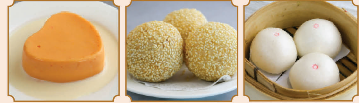
—— 芒果凍布甸 (M) 601 Mango Pudding —— 芝麻煎堆仔 (M) 602 Fried Sesame Ball —— 東海豆沙包 (M) 622 East Ocean Steamed Bun w/ Red Bean Paste