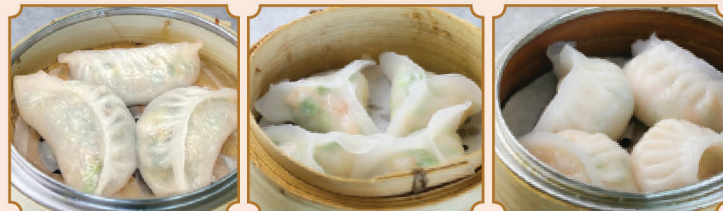
—— 豆苗上素餃 (M) 303 Vegetarian Dumpling —— 晶瑩韭菜餃 (L) 304 Chives & Shrimp Dumpling —— 香茜百花餃 (L) 312 Steamed Shrimp Dumpling w/ Cilantro