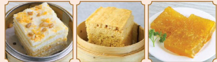
—— 千層糕 (A) 608 Thousand Layer Cake —— 馬拉糕 (S) 609 Steamed Sponge Cake —— 香煎馬蹄糕 (M) 610 Pan-Fried Water Chestnut Cake