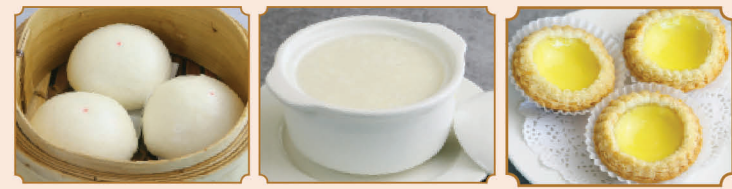
—— 飄香流沙包 (L) 616 Steamed Egg Custard Yolk Bun —— 蛋白杏仁茶 (B)* 620 Puree of Almond Soup w/ Egg White* —— 酥皮蛋撻 (M) 603 Egg Custard Tarts