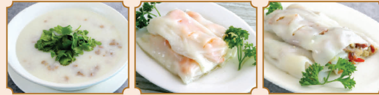
—— 香芹牛肉粥 (SP) 322 Beef Porridge w/ Cilantro —— 鮮蝦腸粉 (B) 307 Rice Noodle Stuffed w/ Shrimp —— 叉燒腸粉 (L) 308 Rice Noodle Stuffed w/ Barbequed Pork