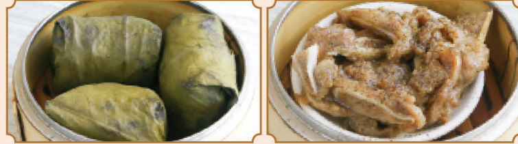
—— 珍珠糯米雞 (B) 401 Sticky Rice w/ Pork, Dried Shrimp & Sun-Dried Scallop in Lotus Leaf —— 黑椒牛仔骨 (L) 409 Steamed Beef Back Ribs w/ Black Pepper Sauce