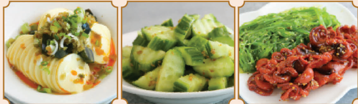
—— 皮蛋涼拌豆腐 (M) 104 Soft Tofu & Preserved Eggs —— 薑汁青瓜 (M) 106 Cucumber in Ginger Sauce —— 海草八爪魚 (C) 712 Seaweed w/ Octopus