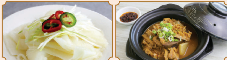
—— 白灼牛柏葉 (G) 202 Poached Beef Tripe —— 柱侯牛什煲 (C) 203 Beef Intestines Stew