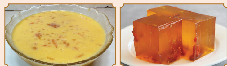
—— 楊枝甘露 (S) 612 Mango Pomelo Sago —— 宮廷桂花糕 (M) 619 Imperial Osmanthus Gelatin