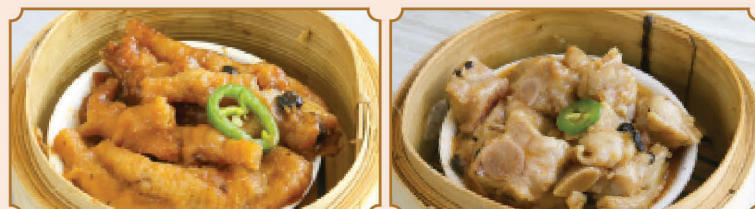
—— 豉汁蒸鳳爪 (M) 504 Steamed Chicken Feet —— 豉汁蒸排骨 (A) 505 Steamed Pork Ribs