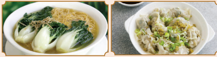
—— 上湯生麵 (L) 208 Noodle Soup —— 上海雲吞 (C) 107 Shanghai Won-Ton