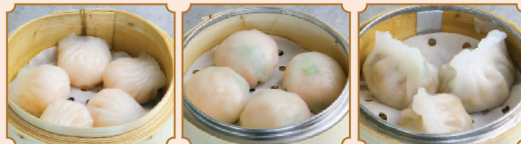
—— 東海蝦餃皇 (B)* 302 East Ocean Jumbo Shrimp Dumpling* —— 鮮蝦水晶餃 (L) 305 Crystal Shrimp Dumpling —— 潮州蒸粉果 (L) 306 Steamed Dumpling w/ Pork, Dried Shrimp & Peanut