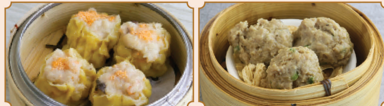
—— 北菇滑燒賣 (L)* 501 Siu Mai* —— 山竹牛肉球 (A) 503 Steamed Beef Meat Balls