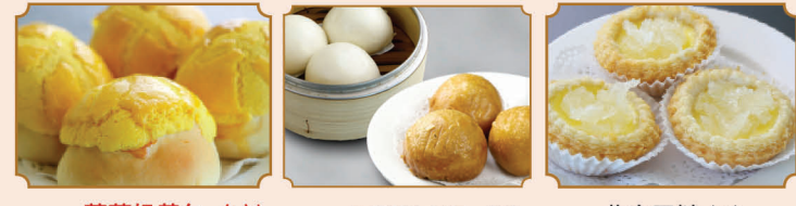
—— 菠蘿奶黃包 (L)* 613 Baked Custard Buns* —— 巧製奶皇包 (A) 614 Custard Buns —— 燕窩蛋撻 (G) 615 Egg Custard Tarts w/ Birds Nest