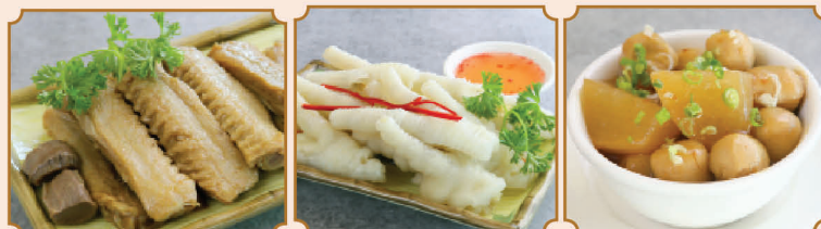
—— 滷水鴨翼 (L) 204 Soy Duck Wings —— 白雲鳳爪 (G) 201 Marinated Chicken Feet —— 蘿蔔魚蛋 (SP) 703 Fish Ball w/ Daikon (Spicy)