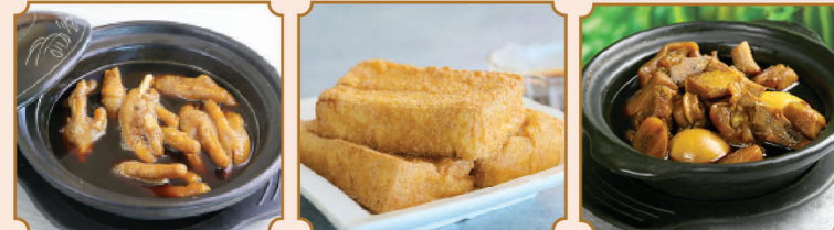
—— 鮑魚汁鳳爪 (SP) 708 Chicken Feet w/ Abalone Sauce —— 滷水豆腐 (L) 711 Golden Pressed Tofu —— 豬腳薑醋 (C) 739 Pig Feet Ginger & Egg in Vinegar