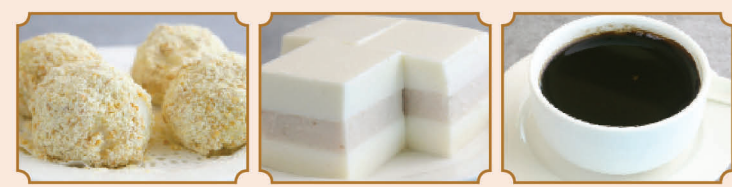
—— 擂沙湯丸 (L) 604 Steamed Sesame Mochi —— 荔茸椰汁糕 (M) 605 Coconut Gelatin w/ Sweet Taro Paste —— 龜苓膏 (M) 607 Tortoise Plastron & Herbal Jelly