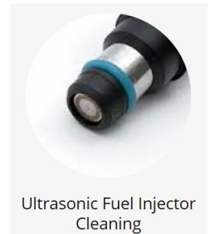
Ultrasonic Fuel Injector Cleaning

let us know they are on their way and we will give you an estimate of when they will be shipped back to you.