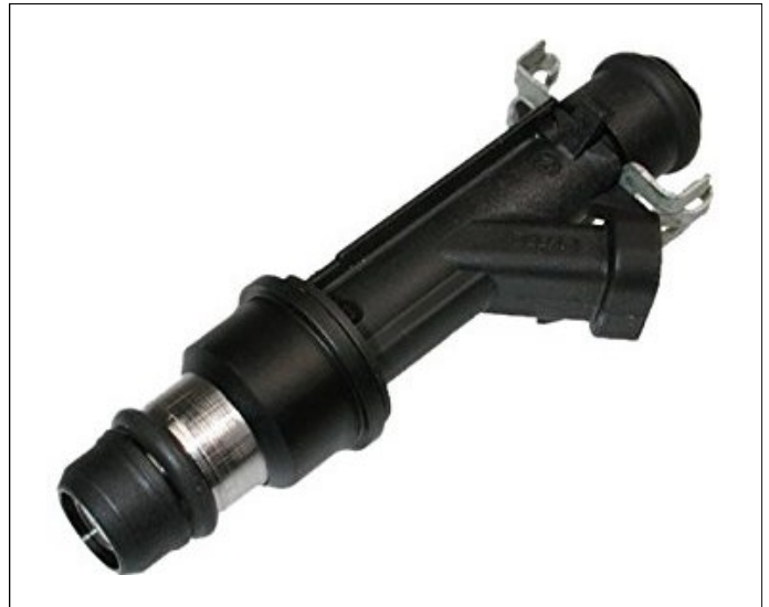
Typical Top-Feed Fuel Injector.

Resistance: a poor test, but we report it none the less.